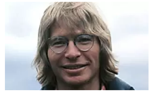
Refugees arriving at 7am at the Port Authority on Aug. 15

Diabetes Can Disappear In 4 Days, Sugar C Drop To 3.9 bloody sugar.online