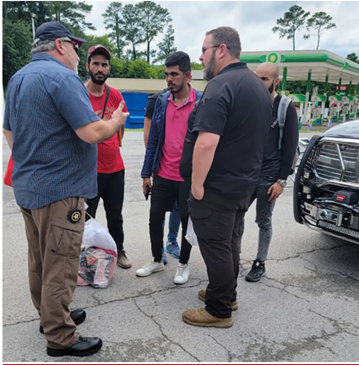
Chatanooga officials have helped 51 immigrants headed to New York City from Texas in 48 hours.