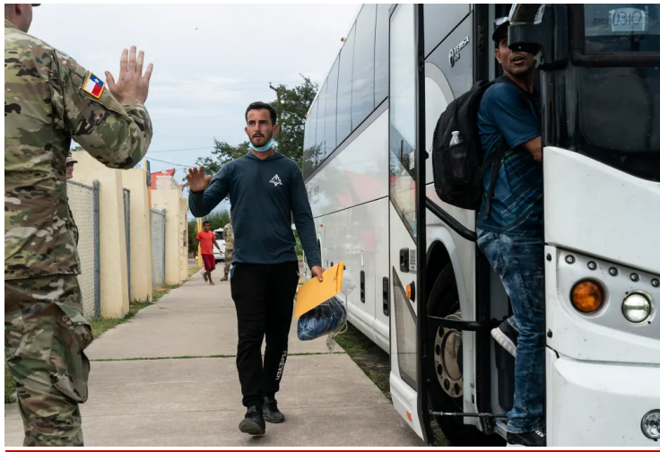
Arrests at the US-Mexico border is on pace to top 2 million for the first time ever.