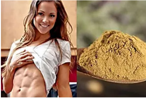
1 Cup of This Daily Burns Pounds of Fat! Try Tonight