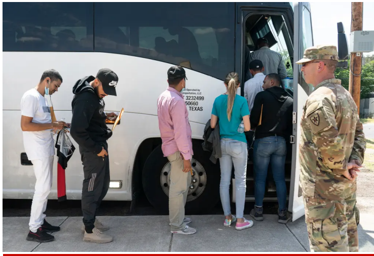
Migrants get on a bus to New York City from Texas as a National Guard officer stand to send them off.