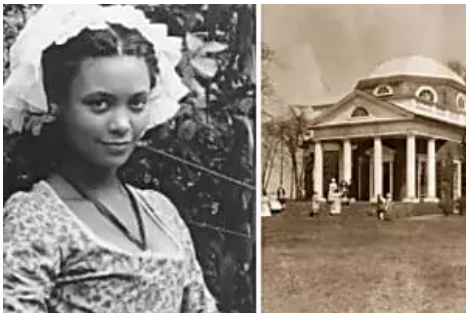
[Photos] She Had Six Children With Thomas Jefferson But Still Lived An Uncomfortable Life