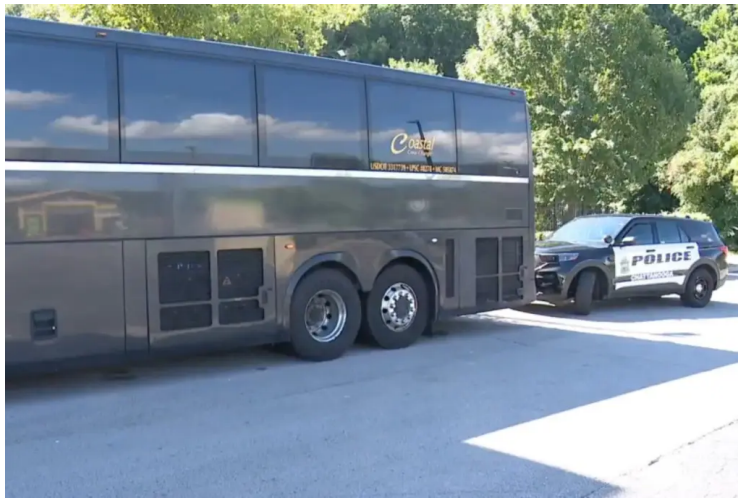
Immigrant children were spotted getting off the bus in Tennessee and asking for money and food when the bus stopped.