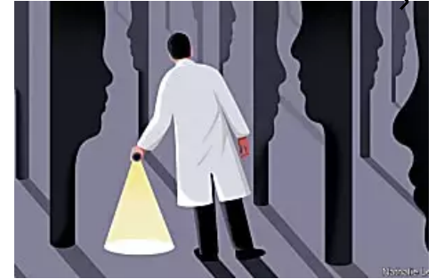
The science behind medicalised gender transitions is weak