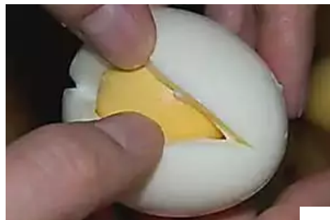
Diabetes Is Not From Sweets! Meet T Main Enemy Of Diabetes

Diabetes Can Disappear In 4 Days, Sugar C Drop To 3.9 bloody sugar.online