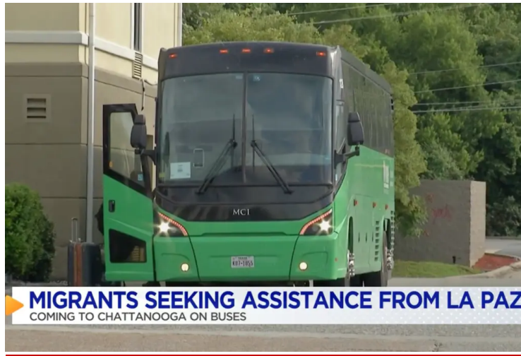
Chattanooga officials did not get a heads up from Texas that the migrant buses were headed their way.