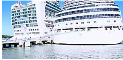
Empty Alaska Cruise Cabins Cost Almost Nothing

Sh Gronk's Favorite "Dressy" Shoes Feel Like Walking On Clouds s