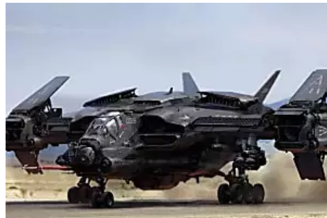
[pics] Air Force One Is Always Followed By This Jet, Here's Why