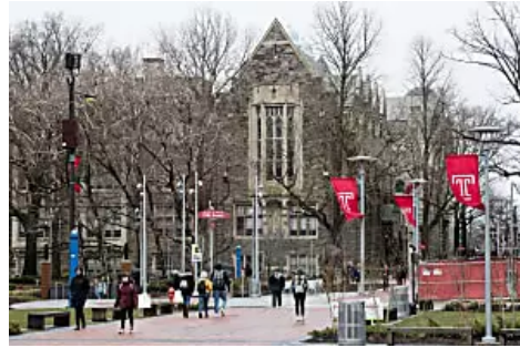
The Forbes Rankings are Out: The 50 Best Colleges in America