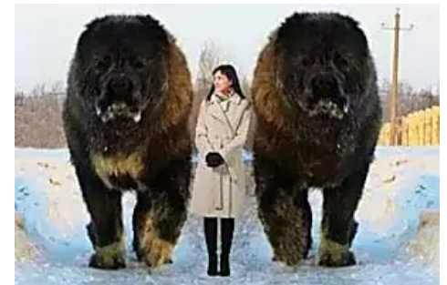
25 Dog Breeds That Will Guard You With Their Life, Ranked