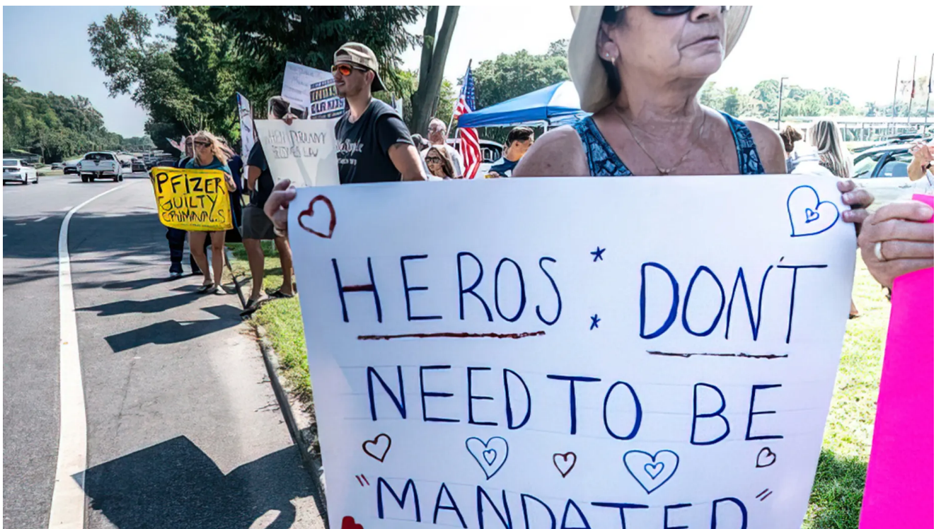
Hauppauge, N.Y.: Health care workers protest against being forced to get the Covid-19 vaccine, outside the New York State Office Building in Hauppauge, New York on Long Island on Aug. 27, 2021.

The state is grappling with staffing shortages this month and moved to cut some nonessential, elective services and procedures by 50%, and Republican Gov. Charlie Baker activated 500 National Guard members to assist hospitals.