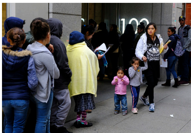
People line up outside a U.S. immigration office with numerous courtrooms in San Francisco.

Another practitioner observed that “some of the judges really don’t understand the evidentiary rules.” 169 One judge told counsel that “I don’t like objections” and “the Federal Rules of Evidence don’t apply, so I can basically do whatever I