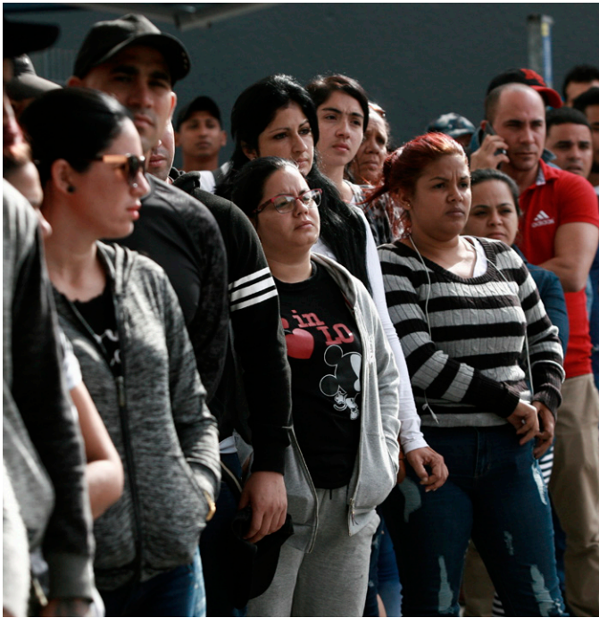
Cuban migrants in Ciudad Juarez, Mexico, wait in line to be processed as asylum seekers in the U.S.

throughout the country to courts along the U.S.-Mexico border in 2017, more than 20,000 cases were delayed in the immigration courts they left behind. 249