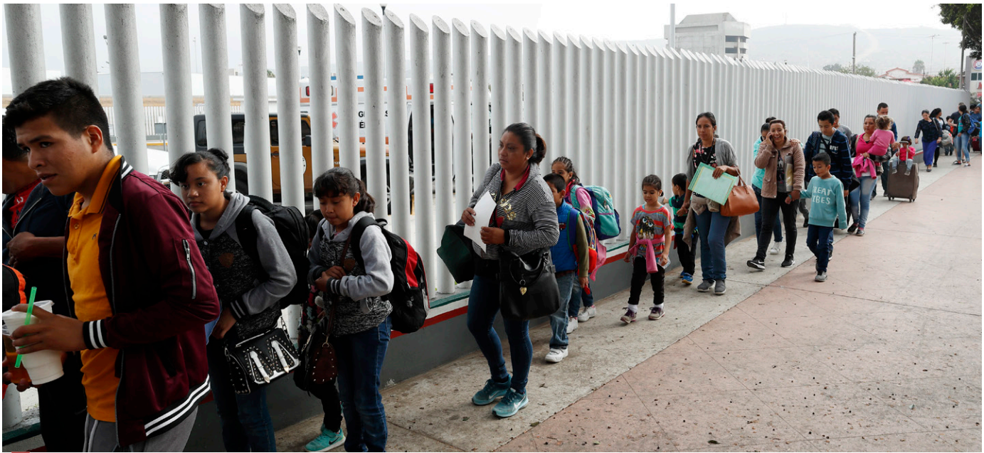
People line up to cross into the U.S. to begin the process of applying for asylum near the San Ysidro port of entry in Tijuana, Mexico. They will enter an immigration court system that has failed to apply immigration law in an impartial and uniform manner.

behavior. These shortcomings are exacerbated by the failure of the administrative appeals process to fulfill its intended role of correcting errors—both legal and procedural, purposeful and accidental—made by immigration judges.