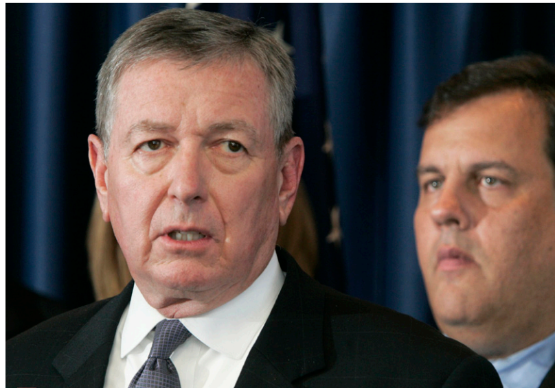
Former Attorney General John Ashcroft, left, reorganized the Board of Immigration Appeals in 2002 by “reassigning” BIA members with whom he disagreed.

One byproduct of such streamlining has been to decrease “the quality of [immigration] decision-making at the administrative level” writ large. 220 Additional streamlining reforms, which would further undermine the integrity of BIA adjudications, have recently been proposed by Attorney General William Barr. 221