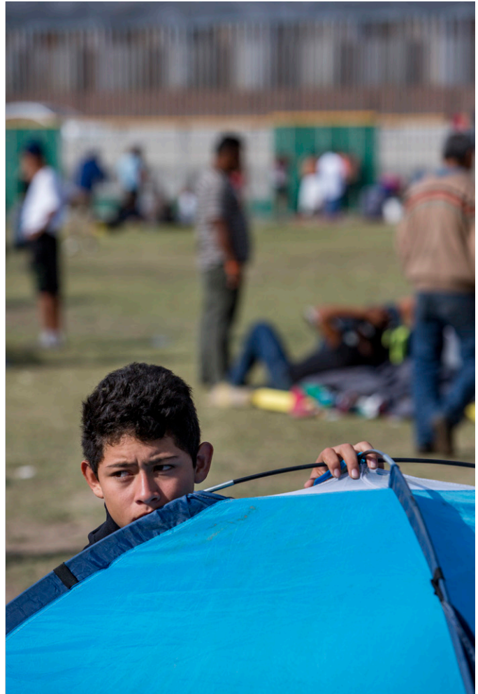
Migrants fleeing Central America and parts of southern Mexico traveled nearly a month before arriving in Tijuana, Mexico, where they were placed in shelters. The migrants, pictured here in 2018, planned to ask the U.S. immigration courts for asylum after presenting themselves at the U.S. port of entry at San Ysidro, California. The immigration courts have widely varying rates of denial for asylum claims.

Impartial immigration judges: “Unbiased, impartial adjudicators are the cornerstone of any system of justice worthy of the label.” 61 In a working immigration court system, immigration judges would serve as impartial adjudicators fairly applying law to facts in each case before them. 62 Accordingly, federal regulations direct that “[i]n all cases, immigration judges shall seek to resolve the questions before them in a timely and impartial manner consistent with the [INA] and regulations.” 63