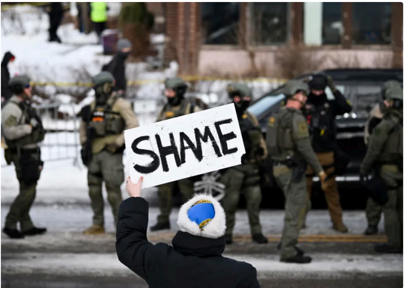
An onlooker holds a sign that reads "Shame" as members of law enforcement work the scene following a suspected shooting by an ICE agent during federal law enforcement operations on January 7 in Minneapolis.

Generally, ICE policy says deadly use of force is only warranted if the subject poses an imminent threat of serious injury and or death. Flight of a vehicle doesn't typically constitute deadly force. ICE officers are trained to approach a vehicle by forming what's known as a "tactical L" to avoid being in front of the vehicle and prevent injury.