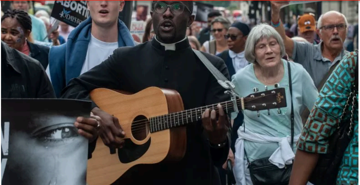
LONDON, ENGLAND - SEPTEMBER 3: The anti-abortion 10 Million Lives Too Many march proceeds up Whitehall on September 3, 2022 in London, England.