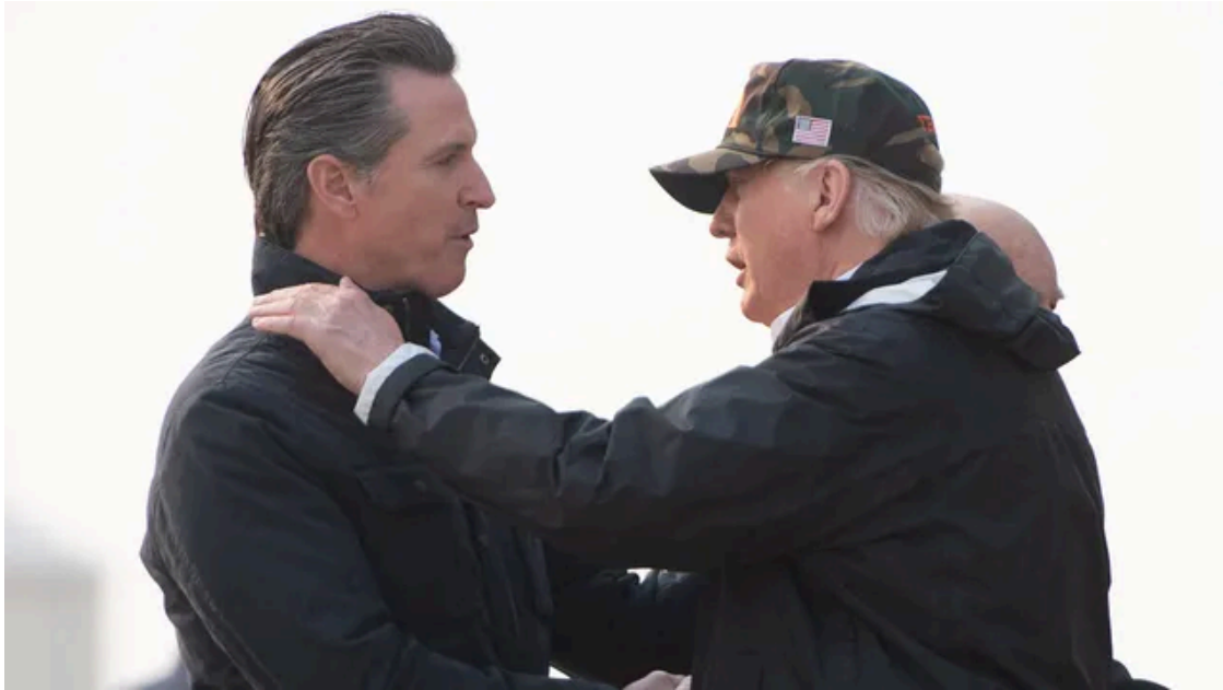
President Trump (R) and Gavin Newsom (L). at Beale Air Force Base in California, Nov. 17, 2018.

President Trump on Monday suggested California Gov. Gavin Newsom should be arrested amid an escalating feud between the two men after days of protests over ICE arrests in Los Angeles.