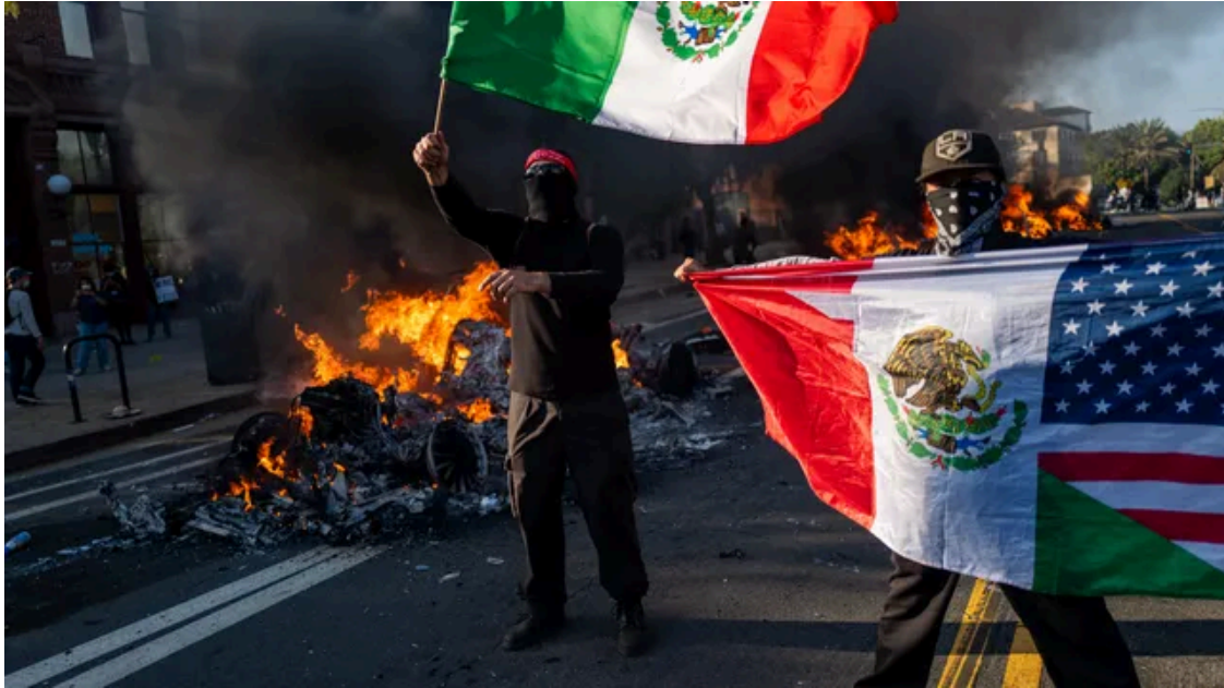
Protesters hold up flags during protests on Sunday after a series of immigration raids in Los Angeles, California.

Senate Republican leadership is urging senators to double down on condemning the chaotic protests that erupted over the weekend in Los Angeles , Axios has learned.