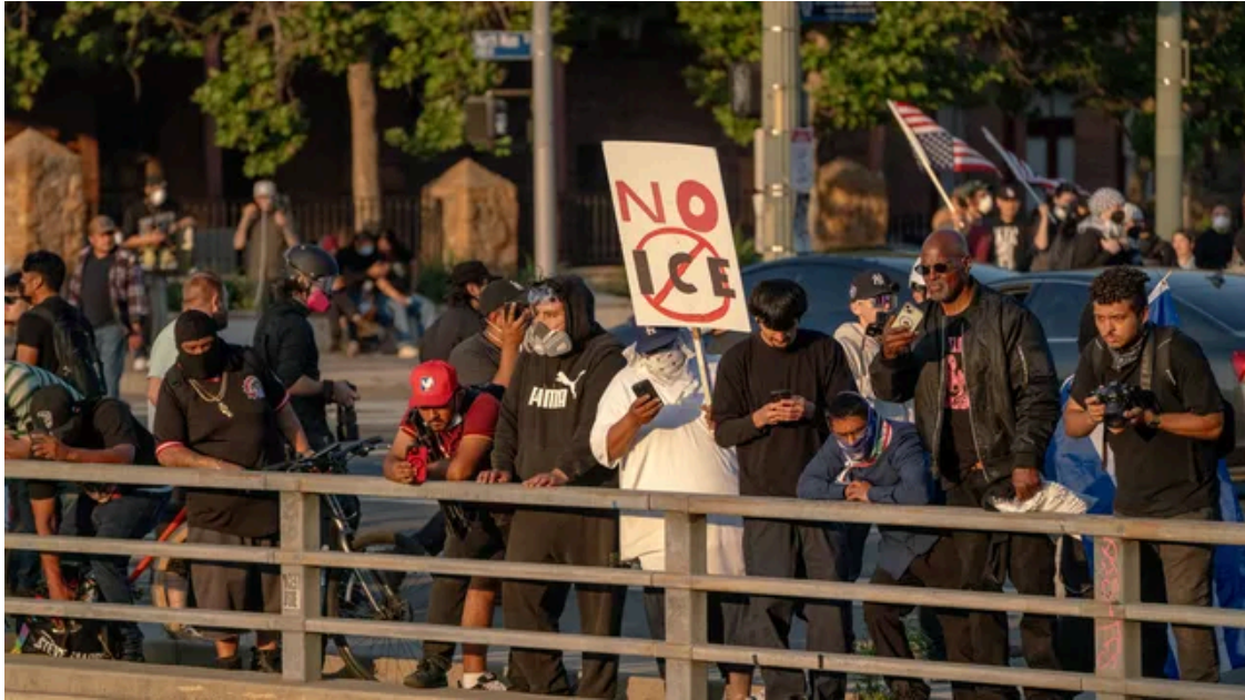
Protesters holding signs protesting ICE enforcement gather along Highway 101 during a demonstration in Los Angeles on June 8.

California Gov. Gavin Newsom (D) announced Monday he's suing the Trump administration over the deployment of the U.S. Marines and the National Guard to Los Angeles protests.