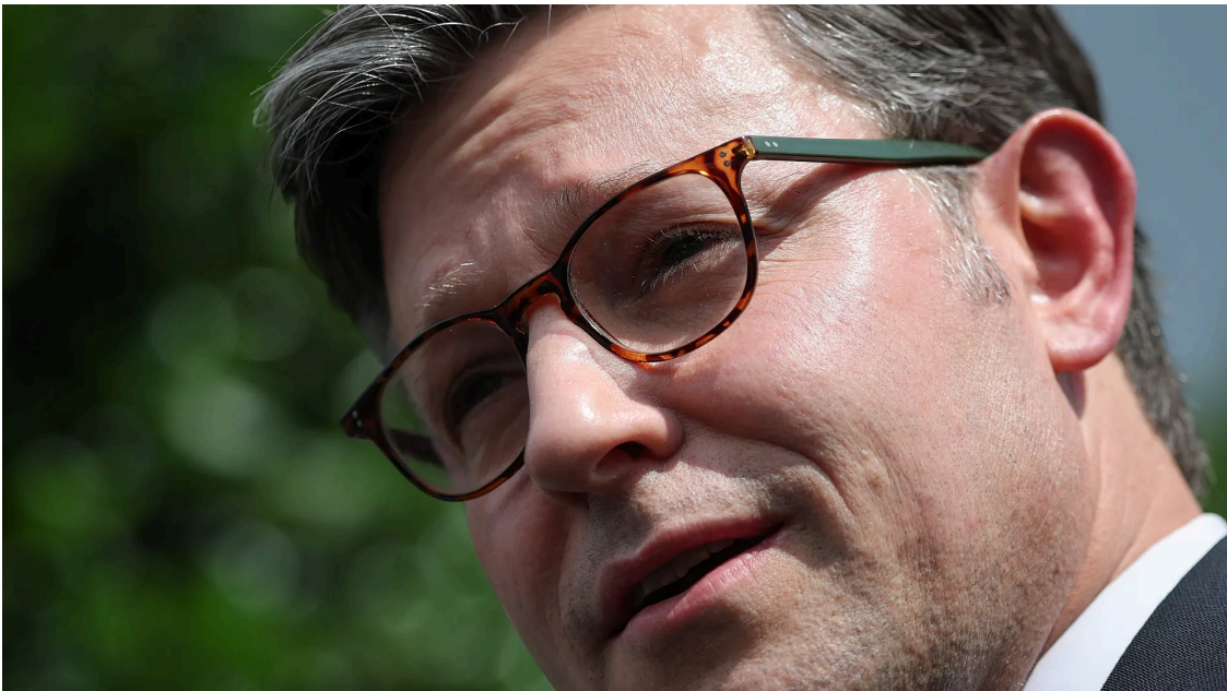
House Speaker Mike Johnson speaks to reporters outside the White House on June 9.