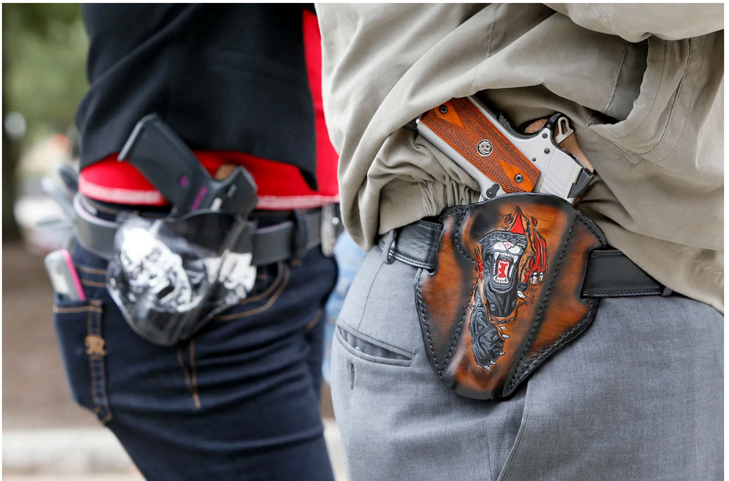
Pistols are seen in custom-made holsters during a rally at the Texas State Capitol in Austin, Texas, on January 1, 2016.