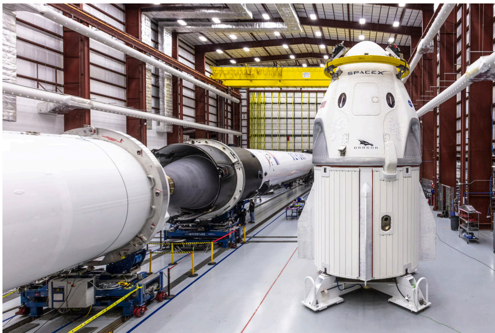
SpaceX's Crew Dragon spacecraft and Falcon 9 rocket at NASA's Kennedy Space Center in Florida in 2018.

SpaceX had already started building its next rocket, Falcon 9, and NASA paid the company in installments for successive milestones and covered some engineering and development work, according to a NASA contract document.