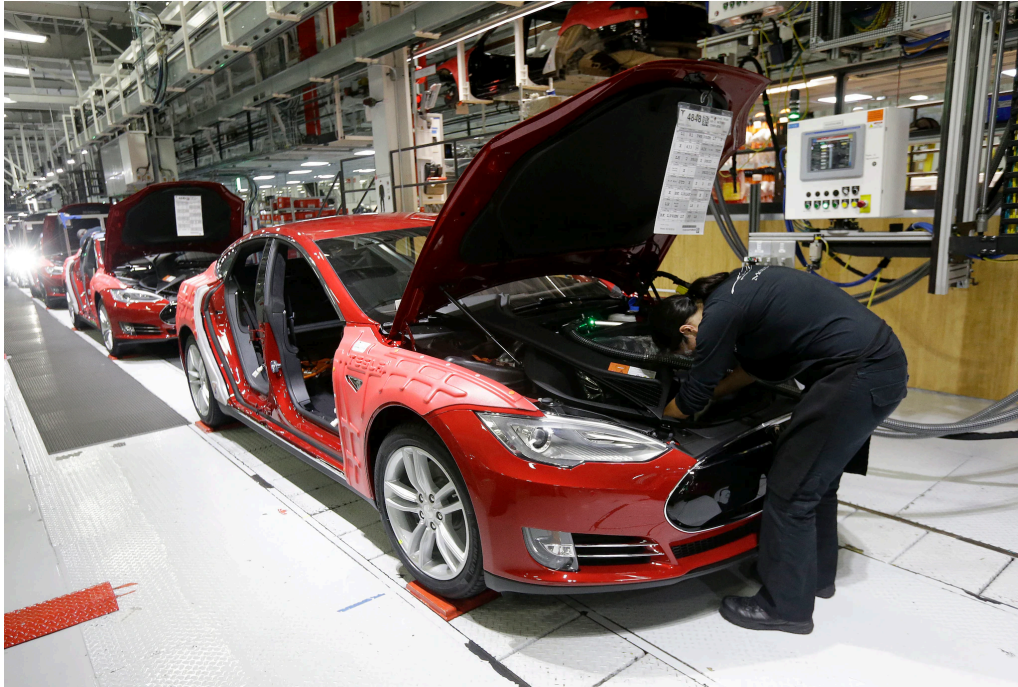
A Tesla employee works on a Model S in Fremont, California, in 2015.

The $465 million Energy Department loan, which arrived in 2010, helped fuel Tesla's meteoric rise: With that money, the company engineered and assembled its luxury electric sedan — the Model S — and bought a factory in Fremont, California, according to the agency . Tesla went public six months later.