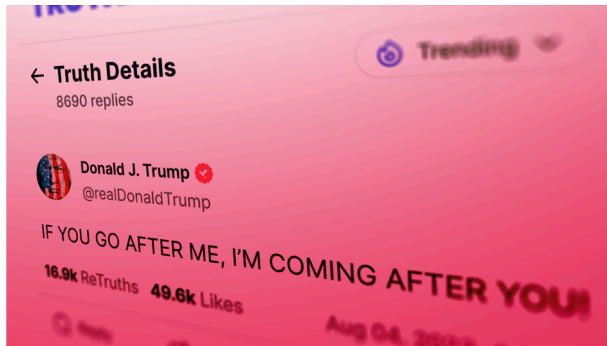
Illustration by Miru Osuga/CREW