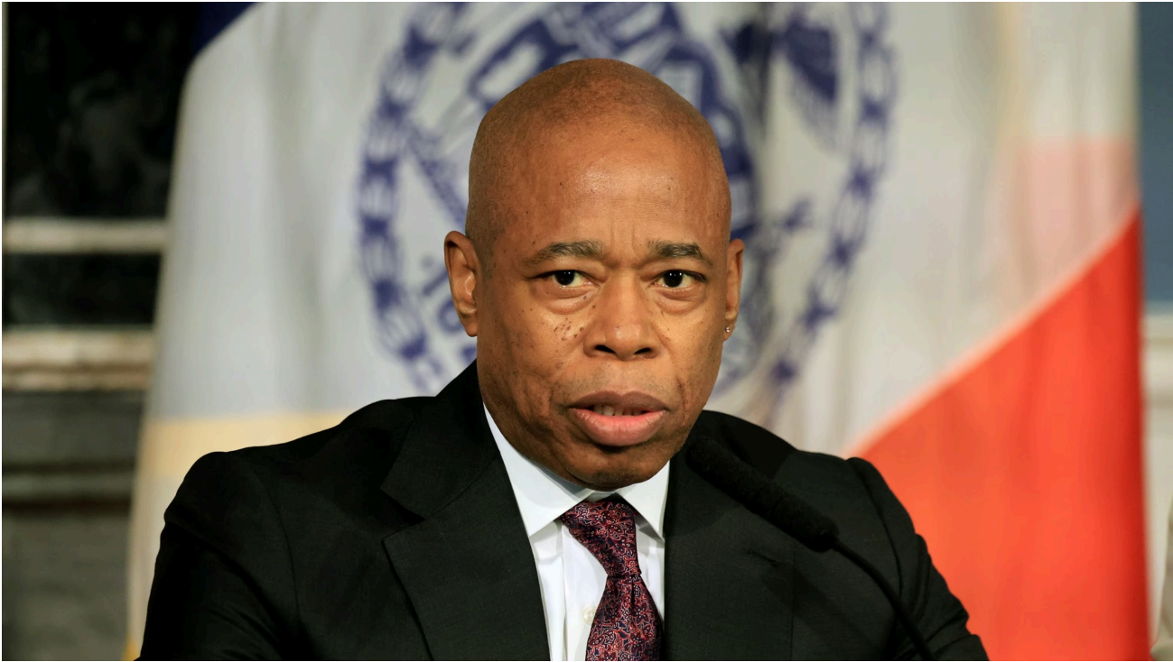
New York City Mayor Eric Adams is pictured during his weekly in-person press conference at City Hall...