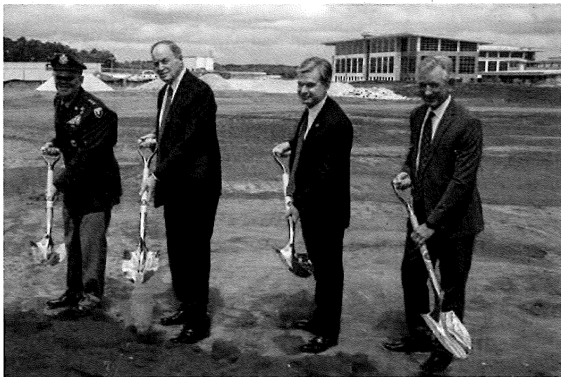
FBI Director Christopher Wray, second from right, attends the groundbreaking ceremony for the Innovation Center at the Redstone Arsenal in Huntsville, Ala., in 2021.

Jordan wants to see the bureau based at Huntsville's Redstone Arsenal, a U.S. Army post where the FBI already has a growing campus that is home to more than 1,000 employees. Although Democrats view the proposal as nothing more than a dig at the FBI, Jordan argues investigators would be less likely to be infected by what he sees as liberal politics if the bureau were based in deep-red Alabama than alongside other government and national-security agencies in and around the nation's capital.