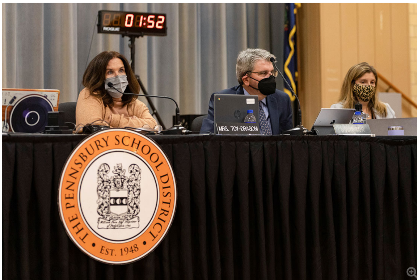
The Board of School Directors of the Pennsbury school district listen to members of the public at a meeting at Fallsington Elementary School in Falls Township, Pennsylvania.

A spokesperson for the Indianapolis FBI office declined to confirm or deny any investigations into these threats. Allen County police documented several of the messages but did not take any further action, according to a police report.