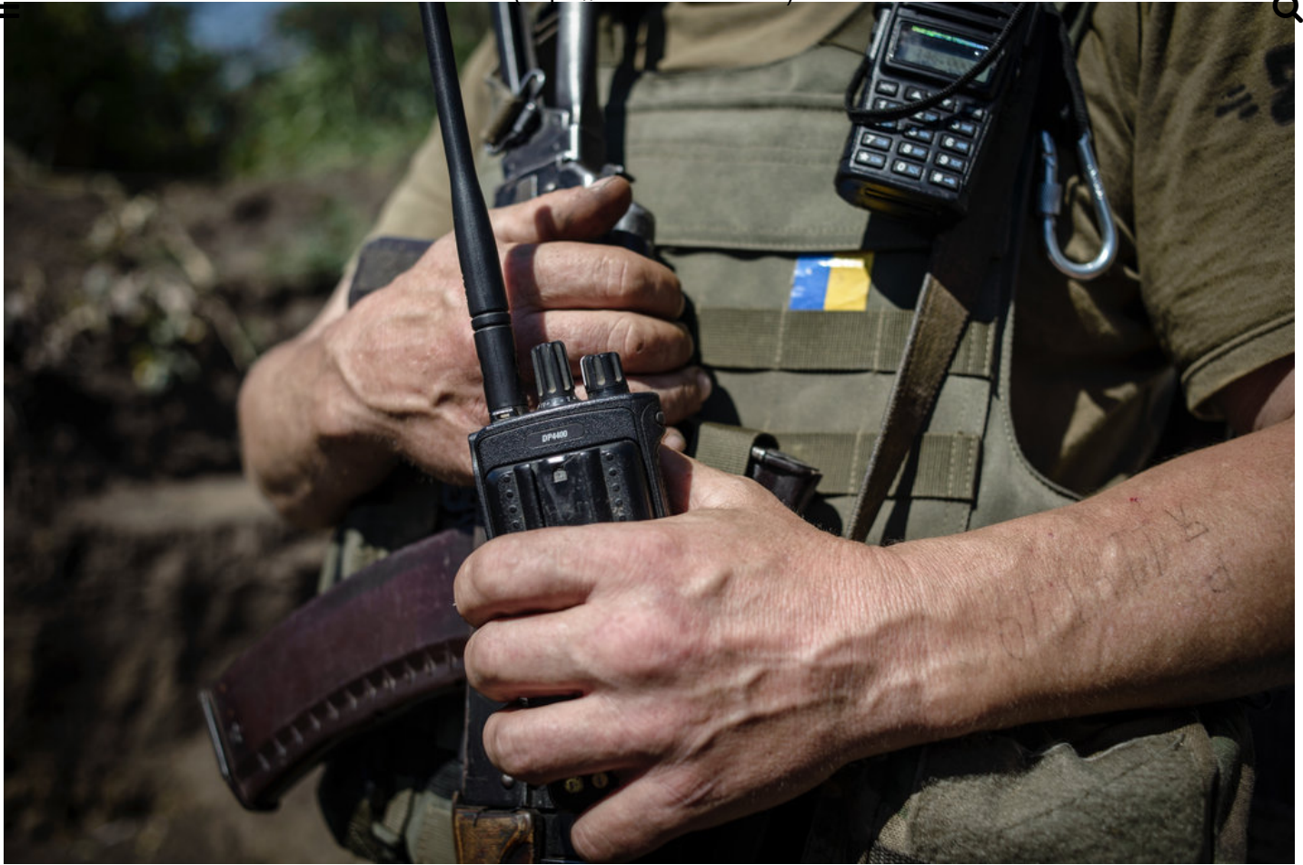
Ukrainian soldiers on the front line in the eastern Donbass region in June 2018.