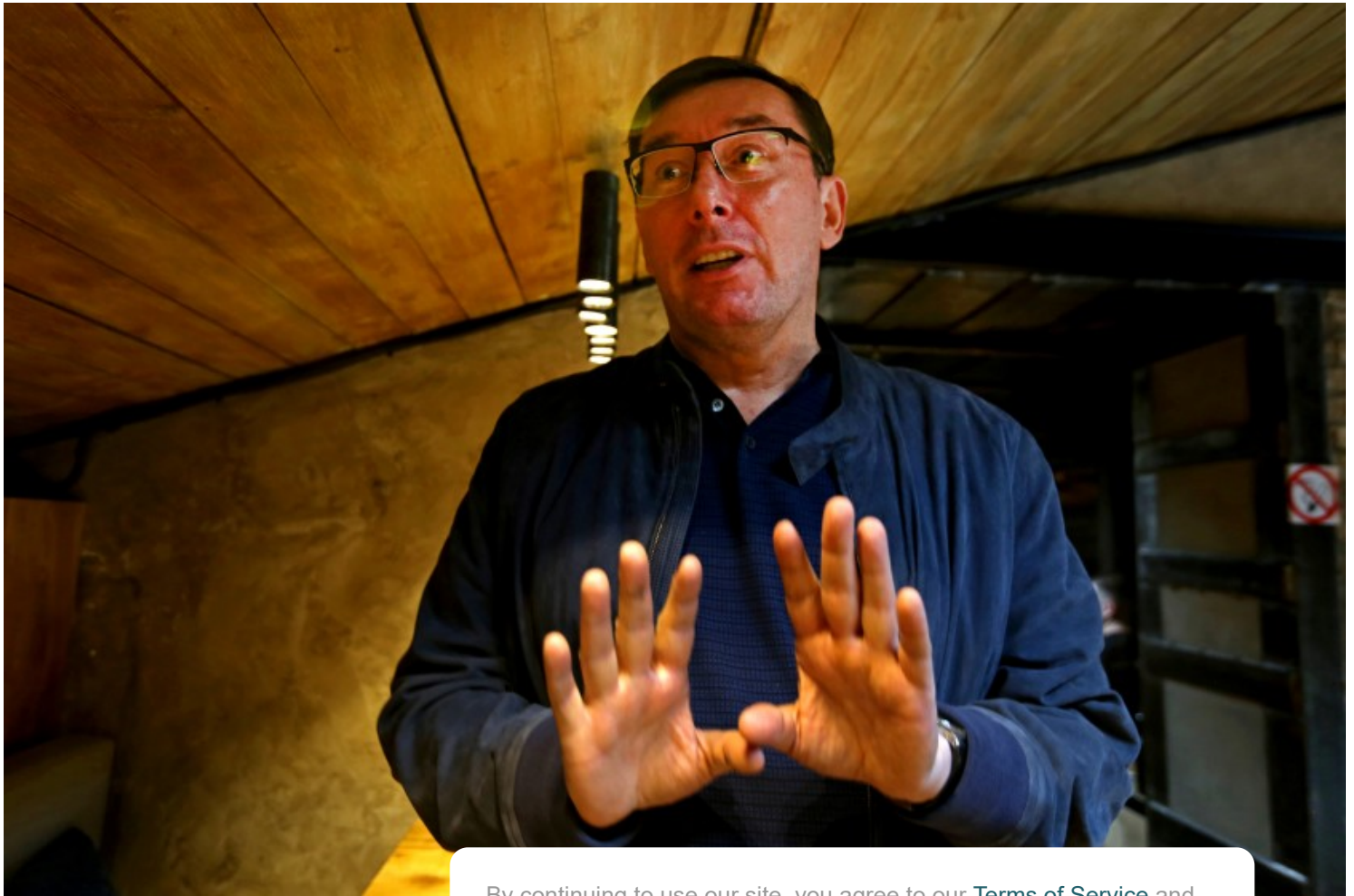
Yuri Lutsenko, the former prosecutor ger For The Times )

By continuing to use our site, you agree to our Terms of Service and Privacy Policy . You can learn more about how we use cookies by reviewing our Privacy Policy . Close