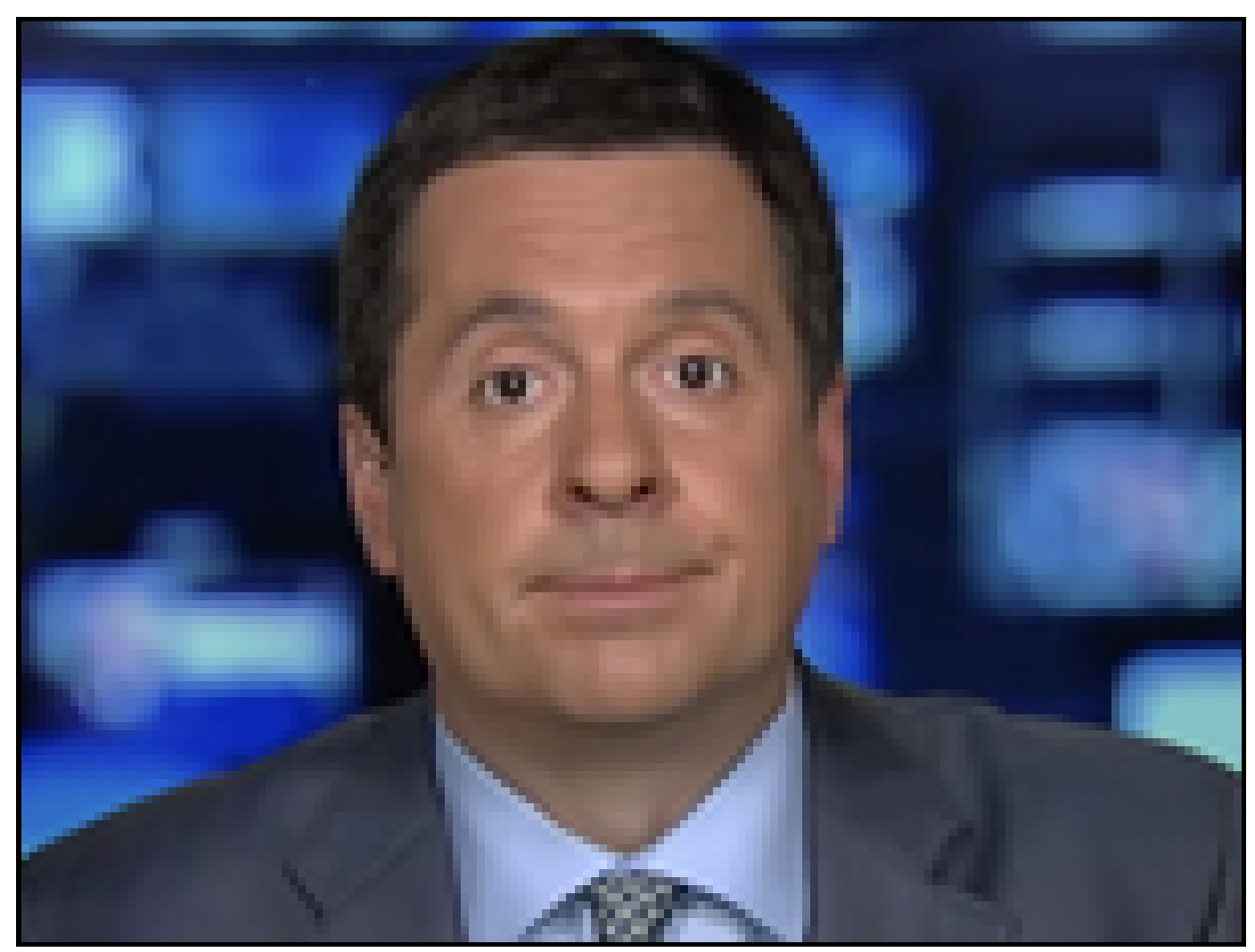
Devin Nunes: Senate Must Look At Fusion GPS's Role In Trump Tower Meeting Before Questioning Donald Trump Jr.