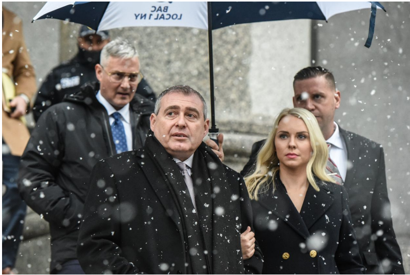
Lev Parnas outside federal court earlier this month. The businessman, who assisted Mr. Giuliani with his investigations in Ukraine, faces campaign-finance charges.

Igor Fruman, Soviet-born émigrés and Trump donors who assisted with his investigations in Ukraine, were arrested in October on campaign-finance charges. They have pleaded not guilty.