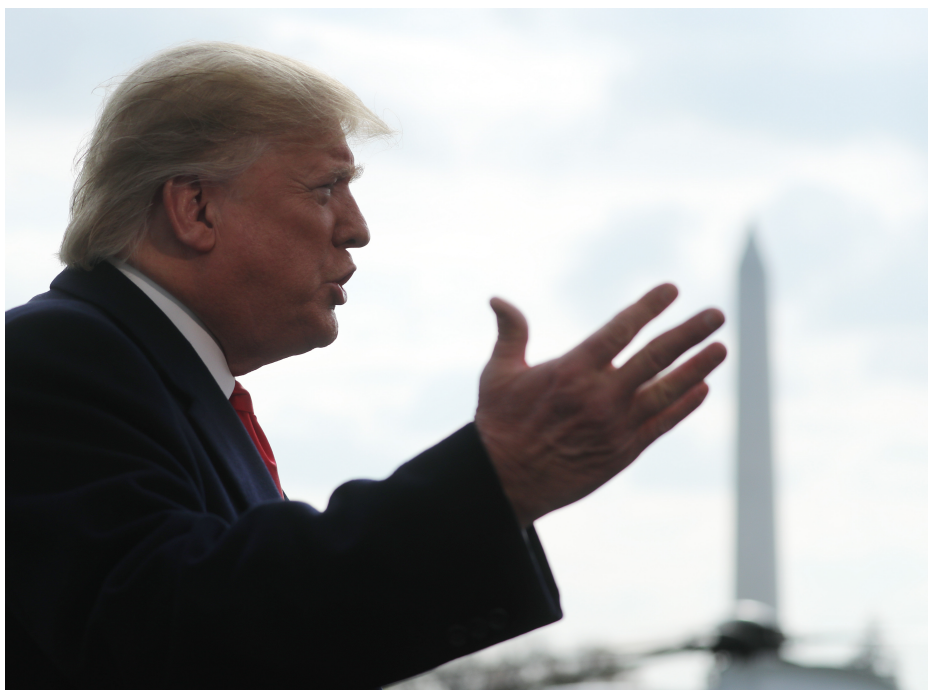
President Donald Trump speaks to the media before departing from the White House on November 20, 2019.

"They are moving forward, and that means likely before the end of the year, likely before Christmas, the House Democrats will vote to impeach President Trump," he said.