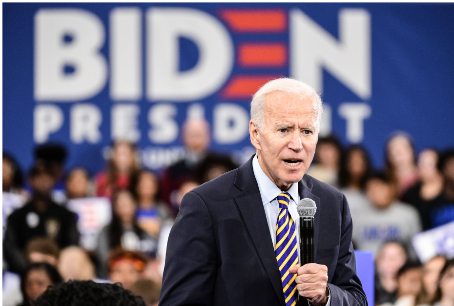
Democratic presidential candidate, former vice President Joe Biden speaks to the audience during a town hall on November 21, 2019.

Former Vice President and 2020 presidential candidate Joe Biden addressed Republican Sen. Lindsey Graham's role in the ongoing impeachment inquiry in an interview with CNN's Don Lemon in South Carolina today.