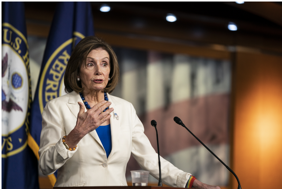
House Speaker Nancy Pelosi speaks to the media during her weekly press conference on November 21, 2019.

More on this: This week, the House Intelligence Committee wrapped up public hearings in the impeachment inquiry. The intelligence committee and two other House panels are now working on a report that could be the basis of articles of impeachment. Democratic sources say the House could possibly vote to impeach President Trump by Christmas. If that vote passes, it would setup a possible impeachment trial in the Senate.