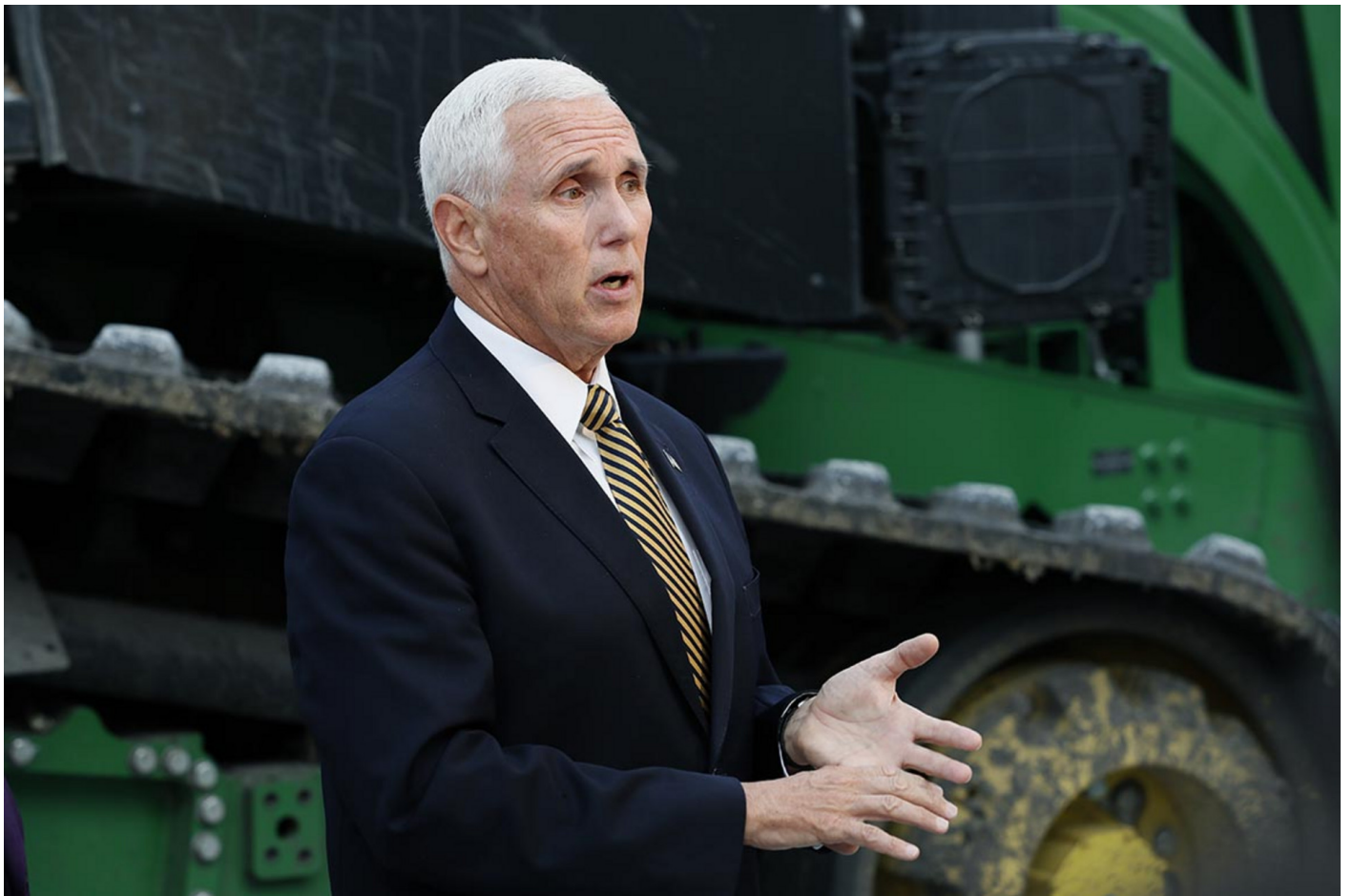
Vice President Mike Pence speaks to reporters in Waukee, Iowa.