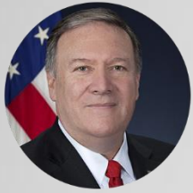
SEC. MIKE POMPEO