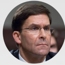
SEC. MARK ESPER