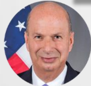
AMB. GORDON SONDLAND