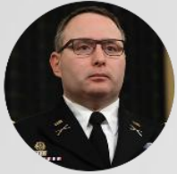
LT. COL. VINDMAN