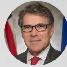
SEC. RICK PERRY