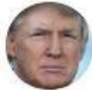
Donald J. Trump ✓ @realDonaldTrump

2:58 PM · Oct 23, 2019 · Twitter for iPhone