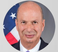
AMB. GORDON SONDLAND

“Absolutely, but we need to get the conversation started and the relationship built, irrespective of the pretext. I am worried about the alternative.”