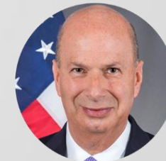
AMB. GORDON SONDLAND