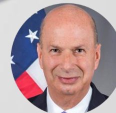
AMB. GORDON SONDLAND