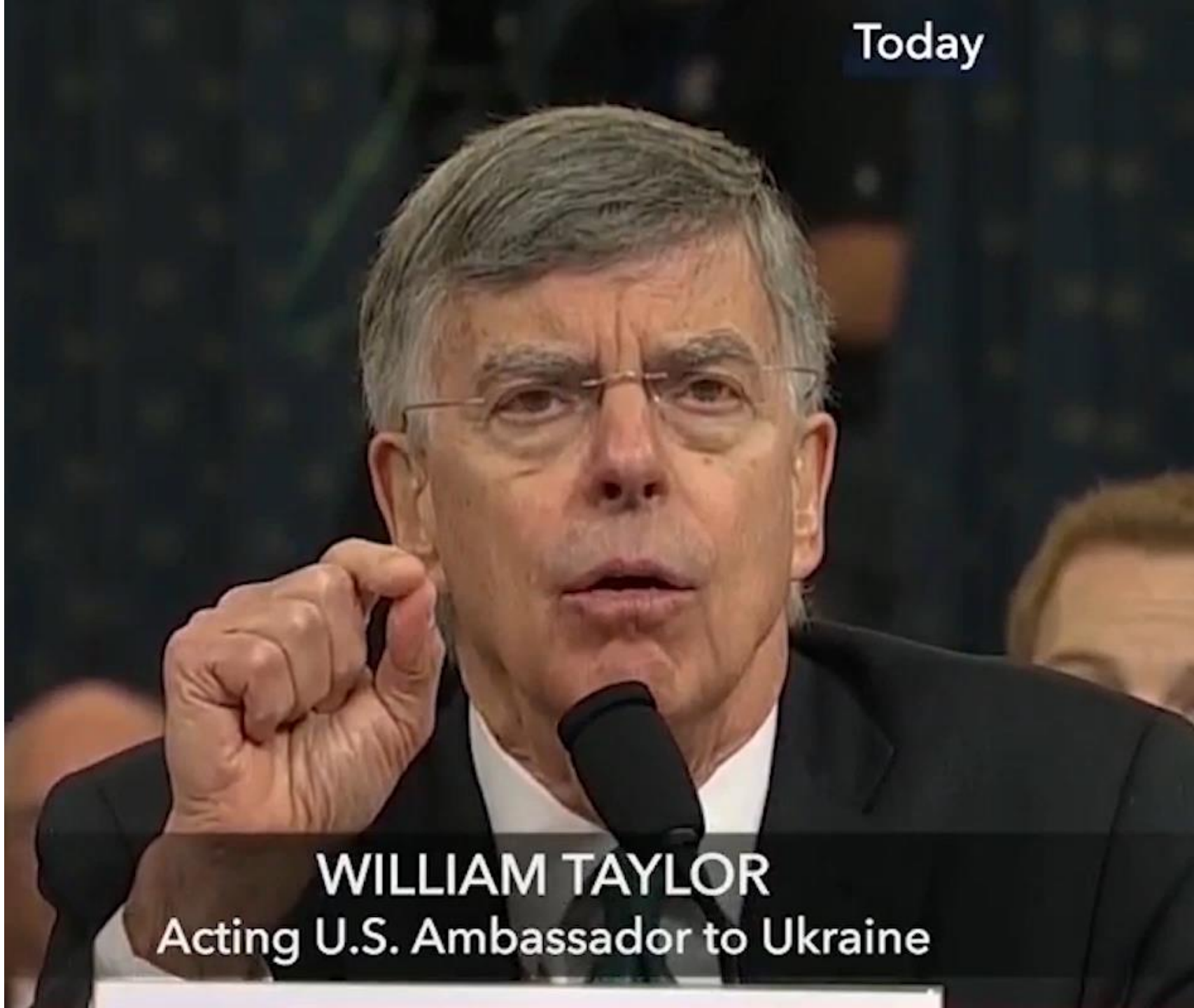
WILLIAM TAYLOR Acting U.S. Ambassador to Ukraine