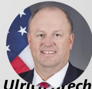
T. Ulrich Dreichbuhl Counselor, Department of State