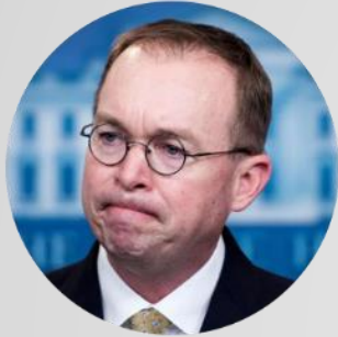
Mick Mulvaney Acting White House Chief of Staff

Defied Congressional Subpoenas at the Direction of the President