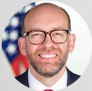
Russell T. Vought Acting Director, Office of Management and Budget