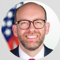
Russell T. Vought

Senior Director for International Energy and Environment, National Security Council