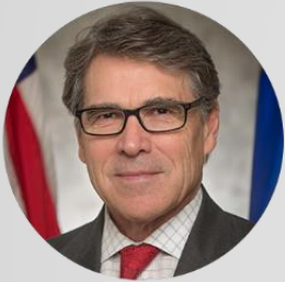
Secretary Rick Perry