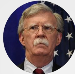
Ambassador John Bolton*