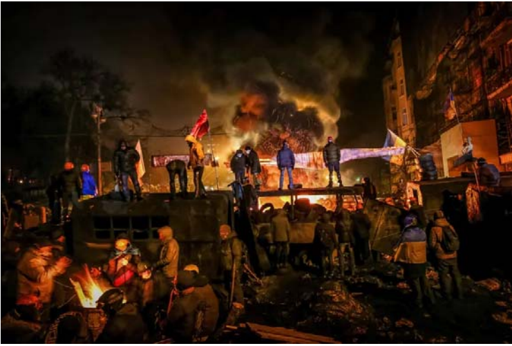
Anti-government protests in Kiev, on 25 January 2014.