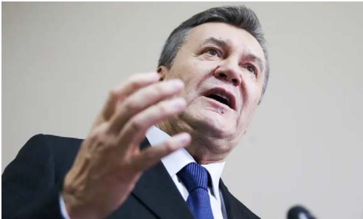
Former president Viktor Yanukovich and his allies are accused of stealing vast wealth from the Ukrainian people.

To frustrate any potential investigations, Ukraine's rulers became masters of the offshore world's network of tax havens. Once money was stolen, it was invested in European and American assets hidden at the end of intricate chains of shell companies, registered through tax havens in the Indian Ocean, Europe and the Caribbean. It is Cyprus, rather than Russia, Germany or America, that dominates the Ukrainian economy: an astonishing 92% of Ukraine's outward investment flowed into the Mediterranean tax haven in 2014.