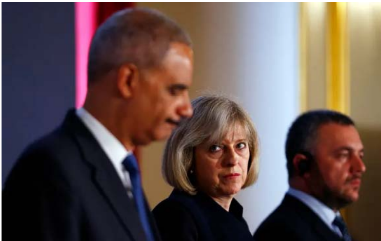
Theresa May and US attorney general Eric Holder (left) at the Ukraine Forum on Asset Recovery in 2014.