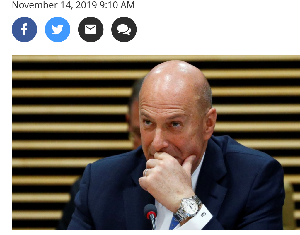
U.S. Ambassador to the EU Gordon Sondland attends the EU-U.S. High-Level Forum in Brussels, Belgium, October 21, 2019.

WORLD Ukrainian Foreign Minister Denies Sondland Linked Military Aid Delay to Biden Investigation By MAIREAD MCARDLE