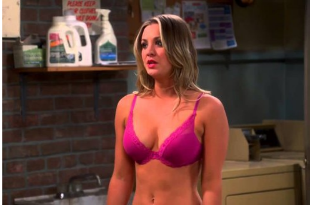
Bet You Haven't Noticed This - Let's Go Back To The Season 1

Malia Obama Didn't Want You To See This instanthub