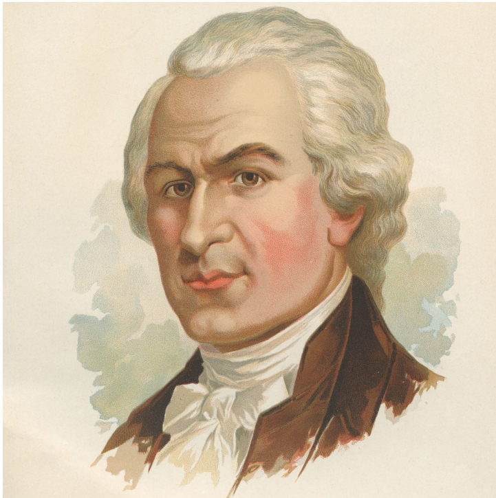
Alexander Hamilton

If Hamilton's words sound prescient, it is because he foresaw how the process of impeachment and removal could easily be exploited for political advantage, as Democrats are attempting now and Republicans tried to do when they impeached President Clinton in 1998. Hamilton was concerned that the decision to impeach and remove "the accused" be based not on "the comparative strength of parties," but rather on "real demonstrations of innocence or guilt." These words imply a quasi-legal process rather than an exclusively political one.