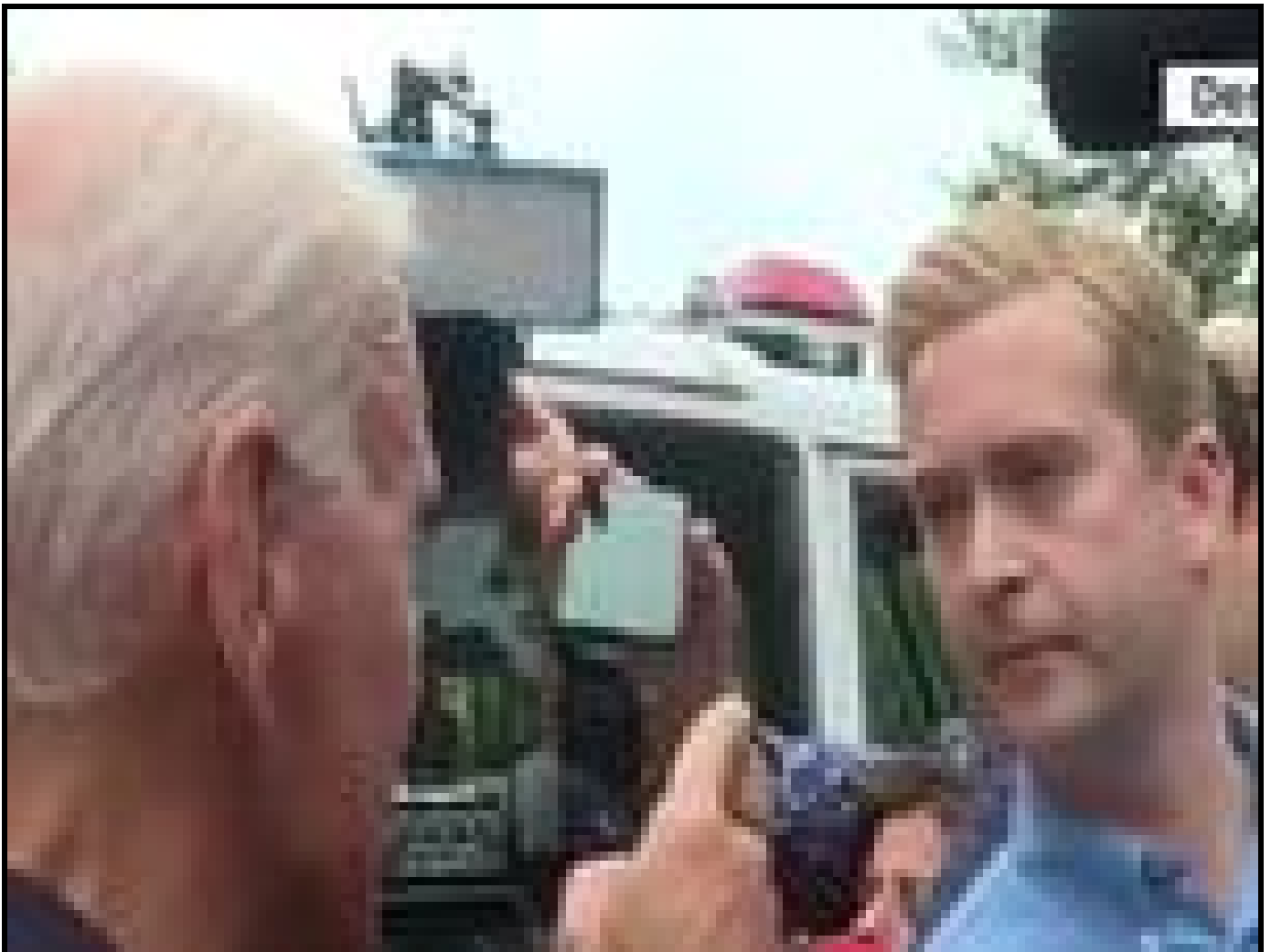
📺 Joe Biden To FOX News Reporter: "Ask The Right Questions" About Ukraine