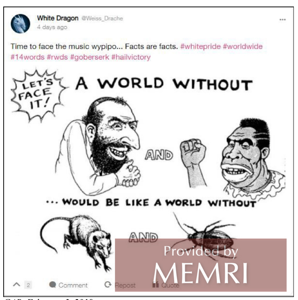
GAB, February 3, 2019