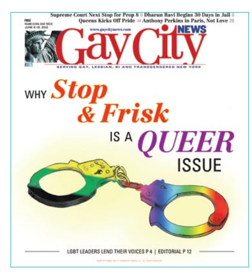
Cover of Gay City News, New York City, June 2012

President Obama's 2013 State of the Union address made history by recognizing LGBTQ and Two Spirit communities' resistance to discriminatory policing during the Stonewall Uprising as a critical moment in the march toward equality. Today, the discriminatory policing and abuse of LGBTQ and Two Spirit people which features prominently in the origin story of the modern LGBTQ rights movement is widely perceived to be relegated to the now distant past by more recent legal, legislative, and policy victories.