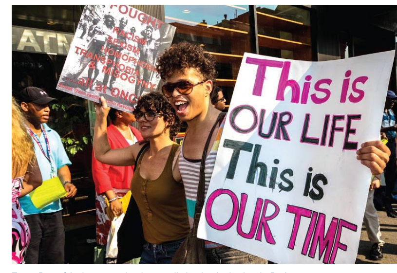
Trans Day of Action, organized annually by the Audre Lorde Project, New York City, June 2013

Each issue certainly warrants additional research to further understand the drivers of contact with law enforcement and incarceration for LGBT people and PLWH, the structural barriers to safety both within and beyond the criminal justice system, and the challenges LGBT people and PLWH face at each point of contact with the system. We encourage advocacy organizations and federal agency staff to adopt and advance the components of the roadmap towards reducing the criminalization of LGBT people and PLWH.