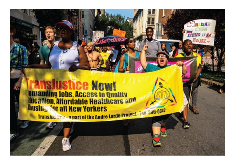
Trans Day of Action, organized annually by the Audre Lorde Project, New York City, June 2012

I have represented many clients in cases where their food stamp or Medicaid benefits are being cut because they are accused of breaking the rules of the program. I have heard the same story many times. Usually a client finds me after they have been to a meeting with an investigator, in which they were bullied and intimidated into signing something. Sometimes they are threatened with jail if they don't sign or are vaguely told something worse will happen if they don't sign. Sometimes they are individuals who do not understand English who were not provided with an interpreter. Almost always they don't know what they've signed. Most often, it turns out they have unknowingly signed a pre-written statement that they have intentionally lied or concealed information in order to receive benefits for which they knew they weren't eligible. The result