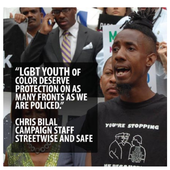
Streetwise and Safe (SAS) campaign staff speak out at Communities United for Police reform rally in support of Community Safety Act, New York City, July 2013

Sometimes our experiences are no different than the rest of our communities. For instance, I was first stopped and frisked just months after I moved to New York as I was riding my bicycle in Fort Greene, as part of the NYPD's "quality of life" policing. The second time I was stopped, police rummaged