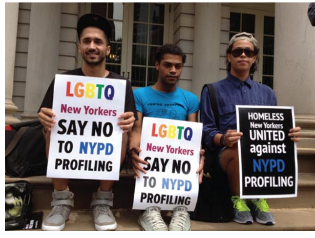
LGBTQ youth leaders from Streetwise and Safe (SAS) advocate for an enforceable ban on police profiling in New York City, July 2013

Stop and frisk affects women of color such as myself. It affects LGBT youth of color such as myself. I have been stopped numerous times by police in the West Village and Chelsea neighborhoods. For instance, I was stopped and frisked three years ago when I was leaving Chi Chiz, a primarily African American LGBT club in the West Village at around 2 AM with a group of four friends who were transgender women and gay men. As we left the club, we were immediately stopped by police who told us to put our hands on the wall. They told us it was a "routine search." There was no reason to believe we were committing any crime. We did what they told us to. I was facing the wall, they pat my arms down, ran their hands between my chest, patted my pockets and then went inside my pockets and pulled my wallet out, checked my ID, made sure none of us had any warrants, and then told us we were free to go, but we better not be around when they came around again. After