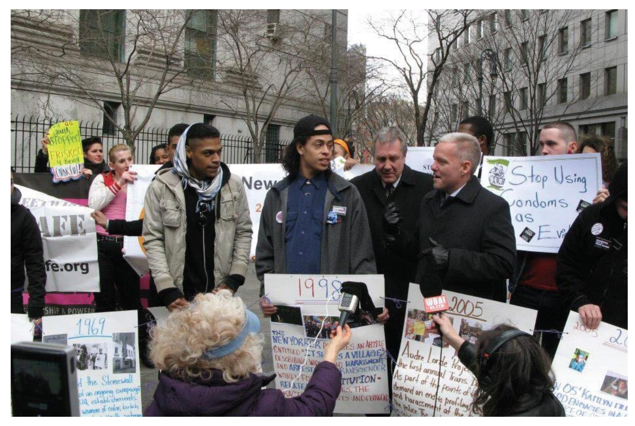
LGBTQ demonstration in support of litigation challenging NYPD stop and frisk practices in New York City, March 2013

Six key topic areas organize the discussion: