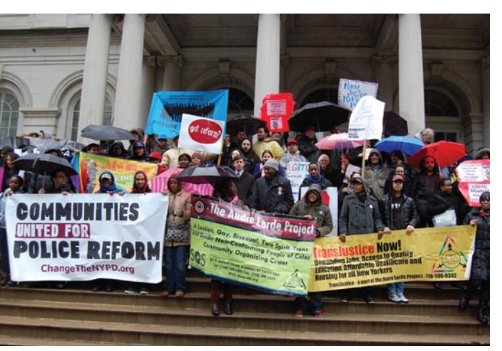
LGBT community organizations join launch of Communities United for Police Reform, New York City, February 2012

In October 2014, I was accompanying a transgender woman to a court date for a default warrant in New Bedford, Massachusetts. When her name was called and she was brought before the judge they placed her in cuffs and sent her into the holding area before they could go forward with the probation violation