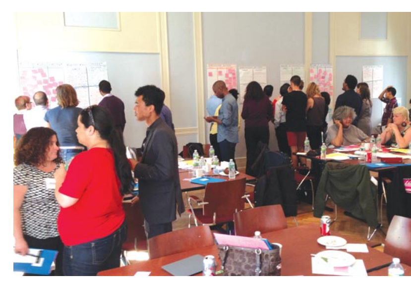
Participants at convening held at Columbia University School of Law May 2013 \,

In May 2013, a working group made up of the authors of the report convened a group of over 50 activists, policy advocates, lawyers, and grassroots organizations working on LGBT, criminalization, and racial justice issues at the local, state, and federal levels for a two-day meeting at Columbia Law School<sup>7</sup> to discuss and articulate a legislative and policy agenda for action on behalf of the communities we serve—namely LGBT people and PLWH who have come in contact with the criminal justice system.