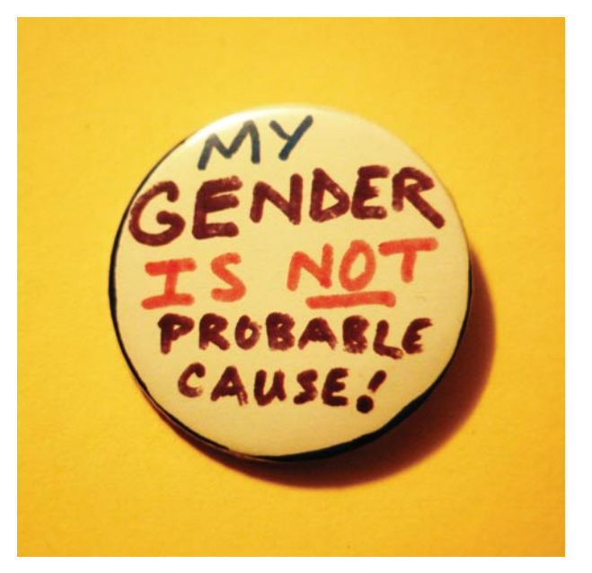
"Know Your Rights" buttons created by LGBT youth leaders at Streetwise and Safe (SAS)