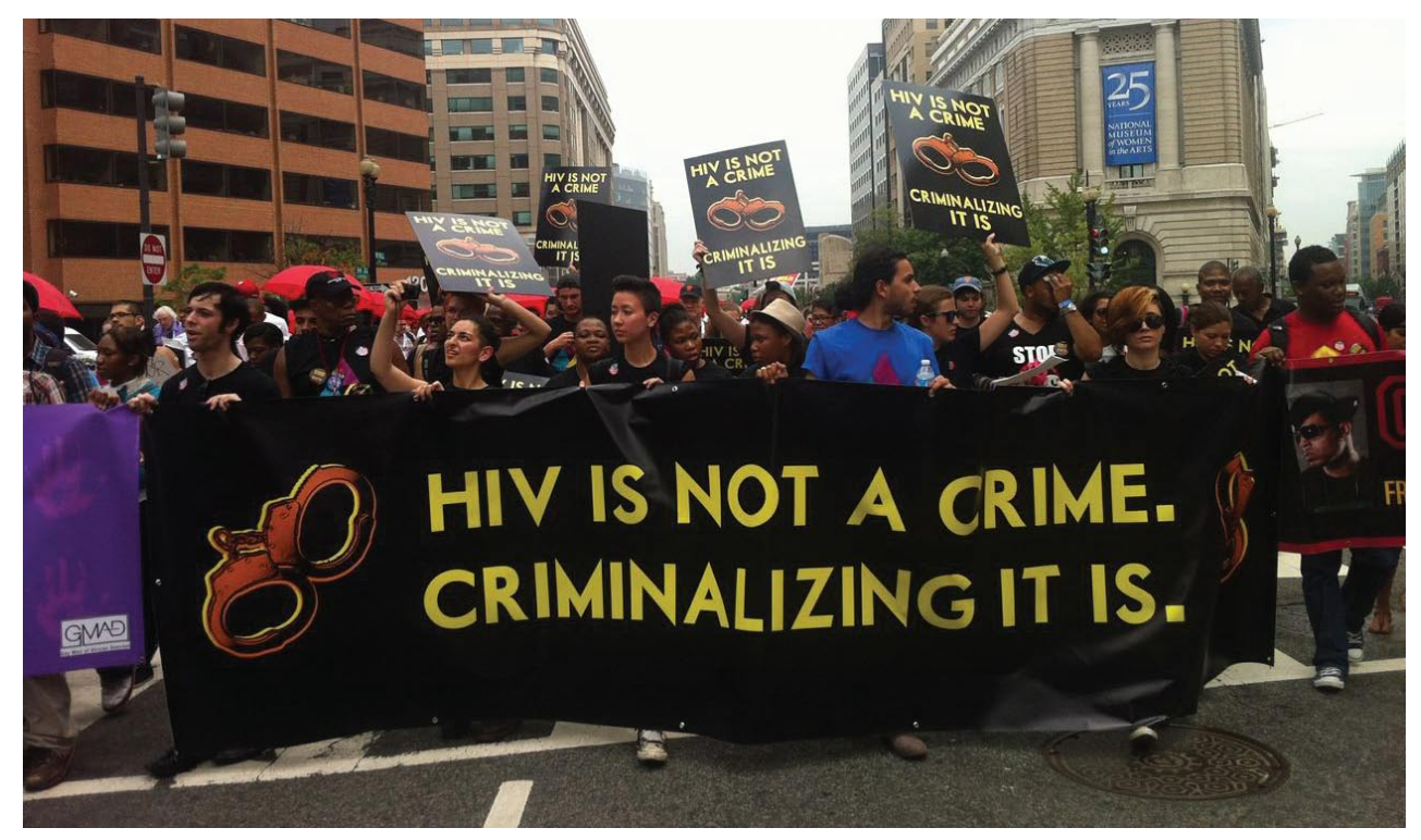
March Against HIV Criminalization, Washington, D.C.