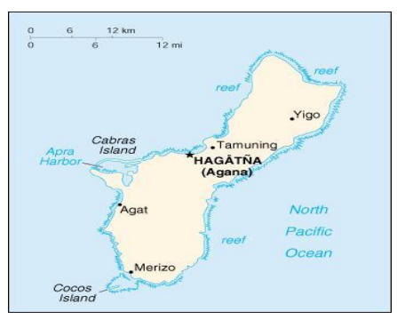
Figure C: Map of Guam.

Guam: Guam is a U.S. territory in the northwest Pacific. It is the largest, most populous, and southernmost island of the Mariana Archipelago. It is governed under the Organic Act of Guam, passed by the U.S. Congress and approved by President Truman on August 1, 1950.6 The development of Guam into an important home for U.S. military bases after World War II profoundly changed the island's agricultural patterns, and Guam now imports most of its food. Guam has a vibrant tourism sector, drawing visitors from many Asian nations, and a robust local and regionally interconnected economy, with commerce ties to the Philippines, South Korea, and Japan. Most of Guam's population, 170,000, are