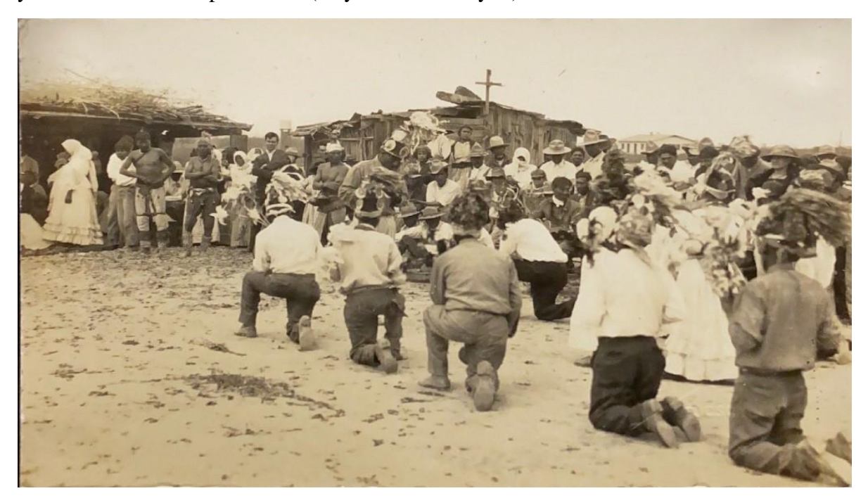
1921 photo Old Pascua Tribal Ceremonies.

Thank you again for your consideration. On behalf of my nation, I want to share our gratitude to this Congress for upholding its trust responsibilities to us. I hope and pray our relationship continues to grow and remains prosperous. As we say back home, Enchy mampo tawak, "it's in your hands." Lios aapo enchim (may God be with you).