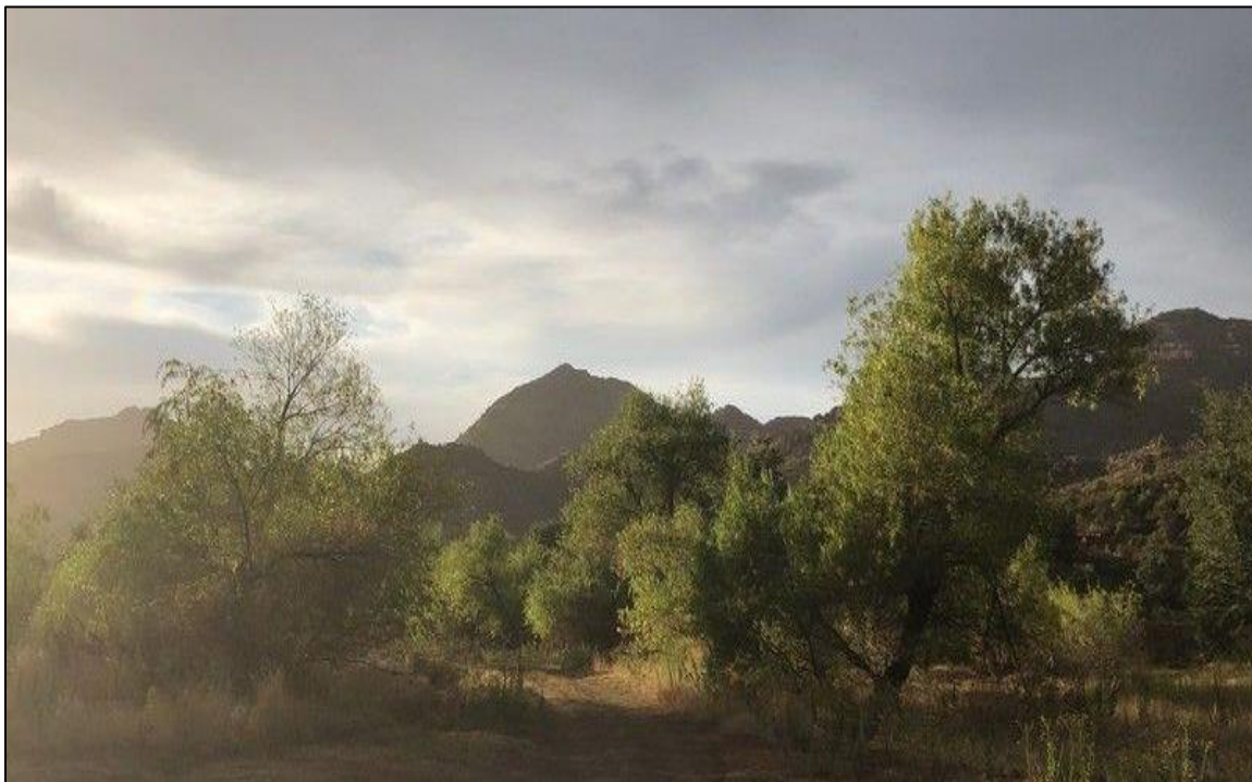
2-ER-251