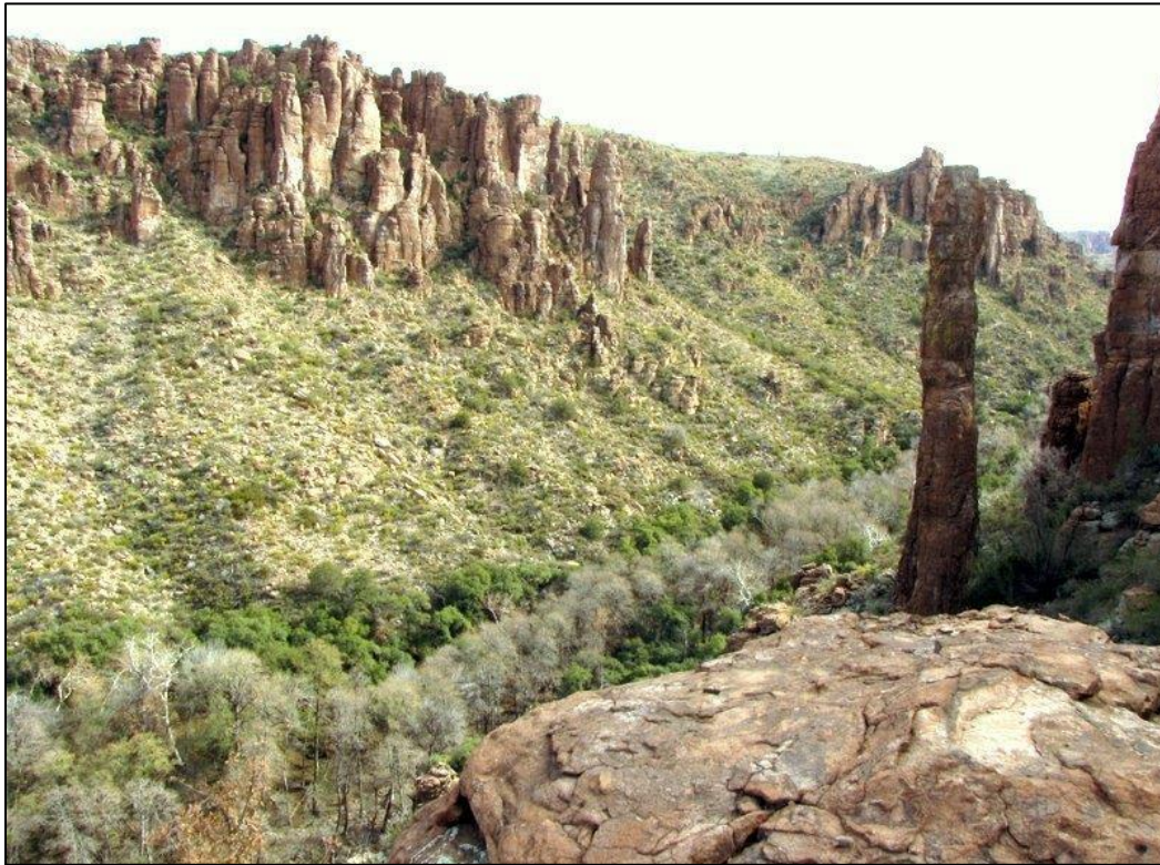
2-ER-251