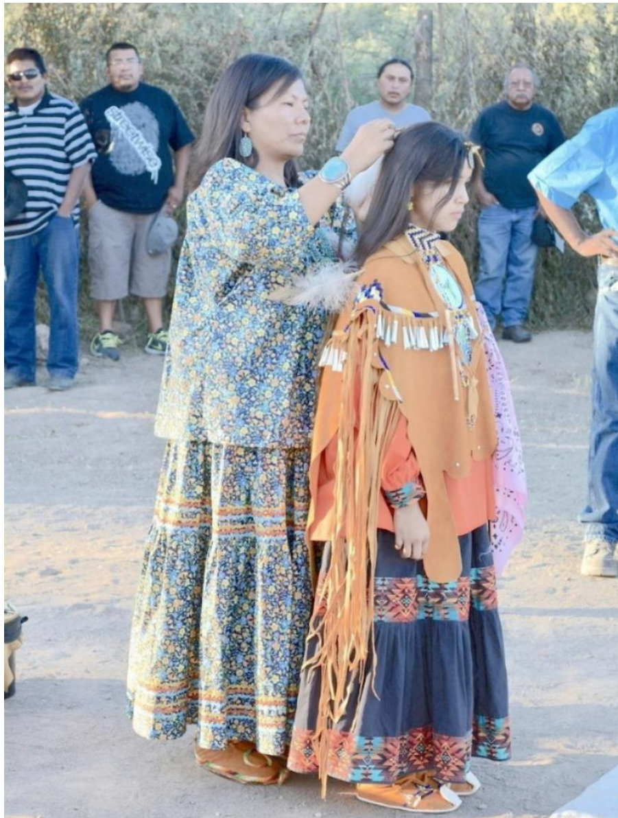
2-ER-133

a woman,” tribal members surround her and sing, dance, and pray, explaining how “the spirit that is within her” will bless and “provide for the people.” 2-ER-73–74.