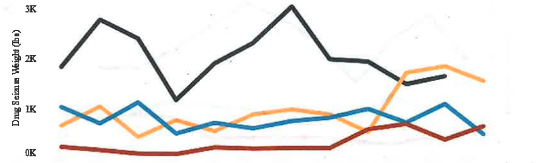
FY Drug Seizure Weight (lbs) by Month