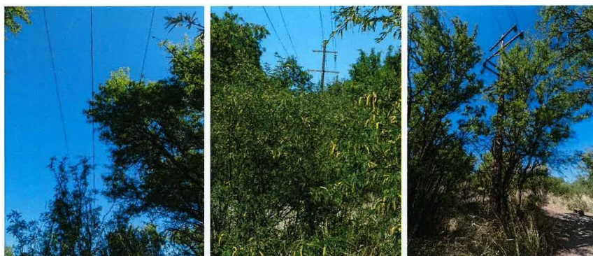
Figure 5: Distribution lines surrounded by overgrown vegetation

Apart from the patchwork of inconsistent and inefficient policies, overstocked and unhealthy federal forests are a major concern for utilities operating in and around them. Recently, utilities across the West have increased spending on vegetation management, infrastructure improvements, and other wildfire mitigation efforts to proactively reduce the risk of a transmission-related fire. For