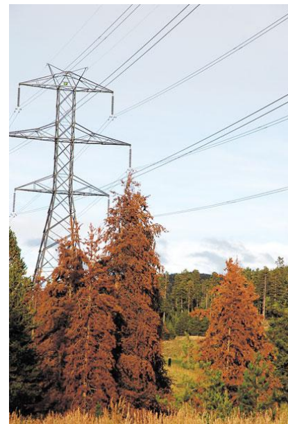
Figure 2: Dead trees near a transmission line, White River National Forest

An electricity ROW can have multiple benefits. While their primary purpose is to facilitate electricity transmission, they also serve as vital corridors for native wildlife and pollinators. 8 The vegetation along ROWs, where trees, shrubs, and climbing vines are prevented from growing into or falling across power lines, maintains a low profile that provides optimal habitat for pollinators, such as bees, butterflies, and hummingbirds. 9 Furthermore, ROWs’ proximity to forest and old field habitats offers birds and other wildlife with valuable resources, including food, nesting, and reproduction sites. 10