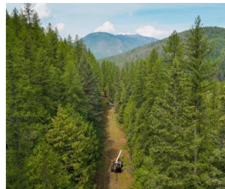
Figure 1: Distribution lines on a ROW

Transmission infrastructure is the backbone of the nation’s power system, ensuring that Americans across the country have constant access to affordable, reliable electricity to power their homes, businesses, and communities. However, catastrophic wildfires, cyberattacks, equipment failures, and harmful federal and state policies, among other issues, threaten the power grid’s reliability. 1 As a result, electricity bills across the country are rising, outages are becoming more frequent, and utilities are struggling to meet the needs of their ratepayers. 2 In response, utilities across the country are adopting wildfire mitigation strategies to reduce the risk of catastrophic wildfire impacting transmission lines, hardening grid infrastructure, to quickly restore service to their ratepayers following an incident. 3