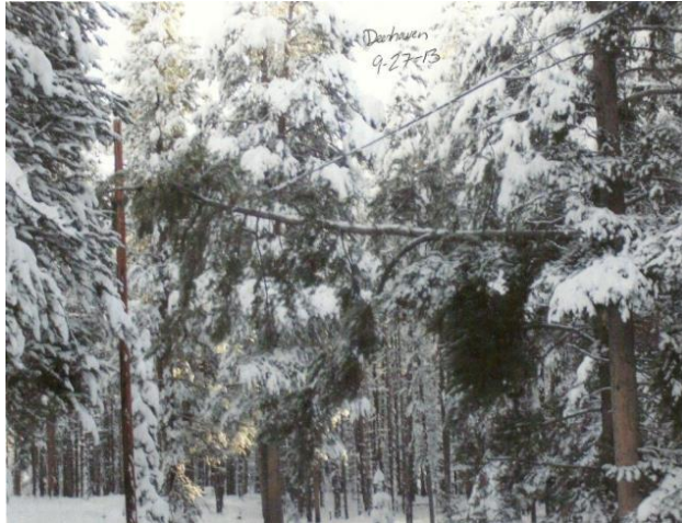
Figure 4. Tree leaning on distribution line in Big Horn National Forest

In 2011, for example, the Jemez Mountains Electric Cooperative, a rural electric cooperative in New Mexico, faced bankruptcy after a wildfire that began in the Santa Fe National Forest caused an aspen tree to fall onto a power line in the utility’s USFS ROW. 20 Although the tree was located outside the ROW, USFS held the utility responsible for firefighting costs, billing it for more than $38.2 million. 21 Because the utility had only $20 million in liability insurance coverage, the remaining costs were ultimately borne by ratepayers. 22