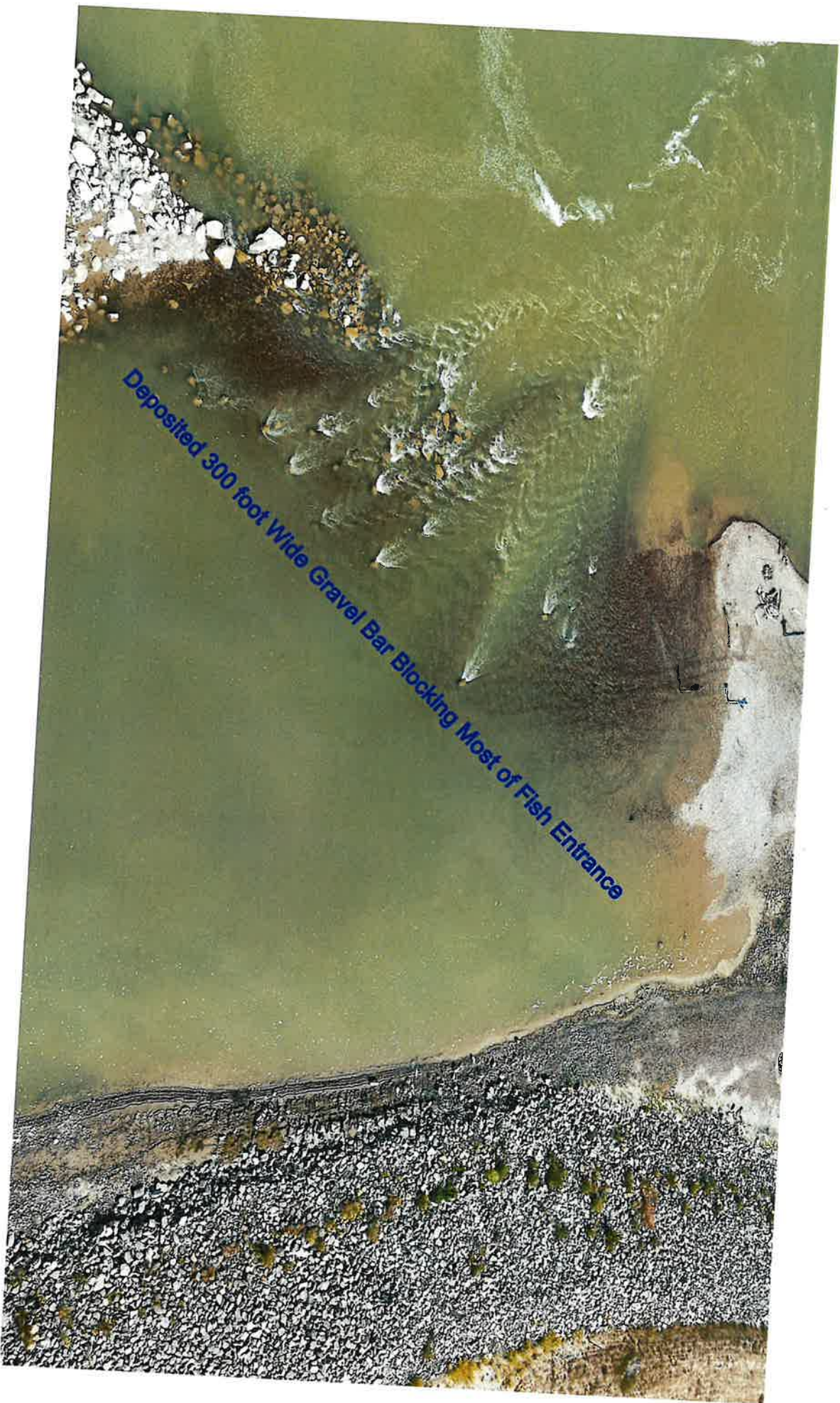
Deposited 300 foot Wide Gravel Bar Blocking Most of Fish Entrance