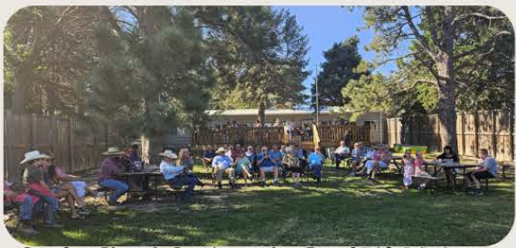
Sunday Church Service at the Good Life Marina