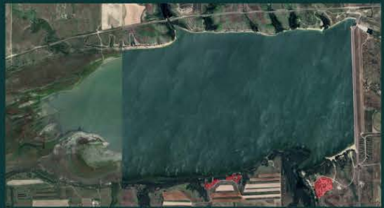
Swanson Concessions & Cabins