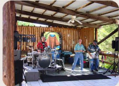
Free Concert at the Light House Marina