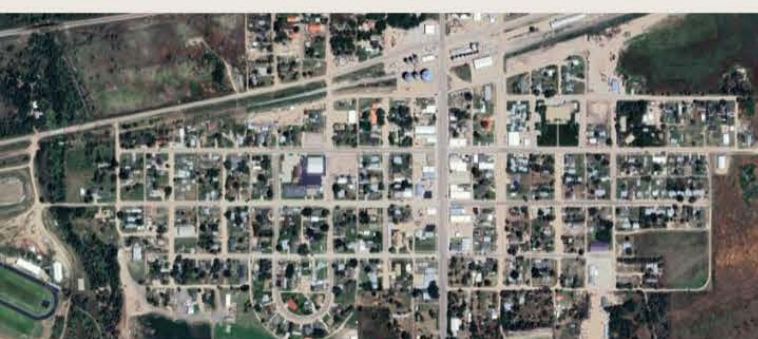
Town of Trenton, NE - 5 miles East of Swanson Reservoir