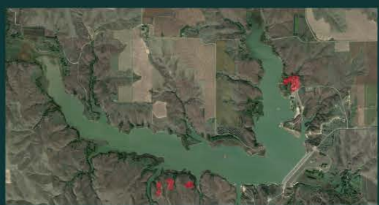
Hugh Butler Concessions & Cabins