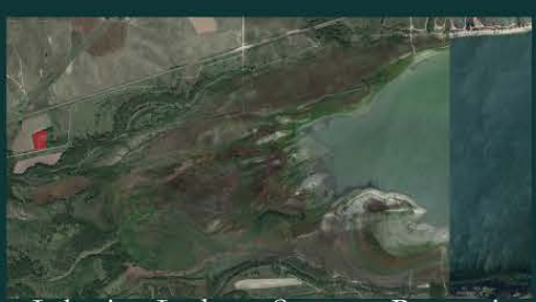
Lakeview Lodge at Swanson Reservoir