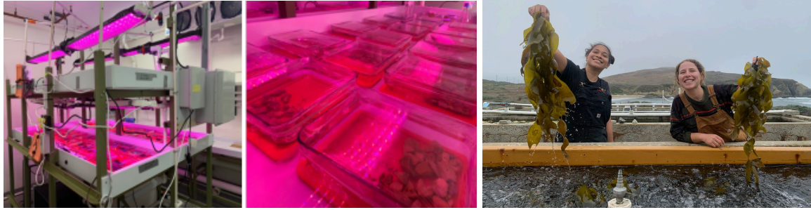
Kelp culturing set-up managed by SSU at the UC Davis Bodega Marine lab (left). Kelp are grown on gravel under conditions and temperatures similar to that of the field (center). At right, growing kelp with restoration staff.

zones. Then, we transport them to the North Coast where our collaborative team of scientific divers runs mesh bags with concentrated spores and twine inoculated with juvenile kelp along the restoration plots. By pairing kelp enhancement with urchin removal efforts, we aim to grow kelp and seed the next generation of kelp plants in the restoration area.