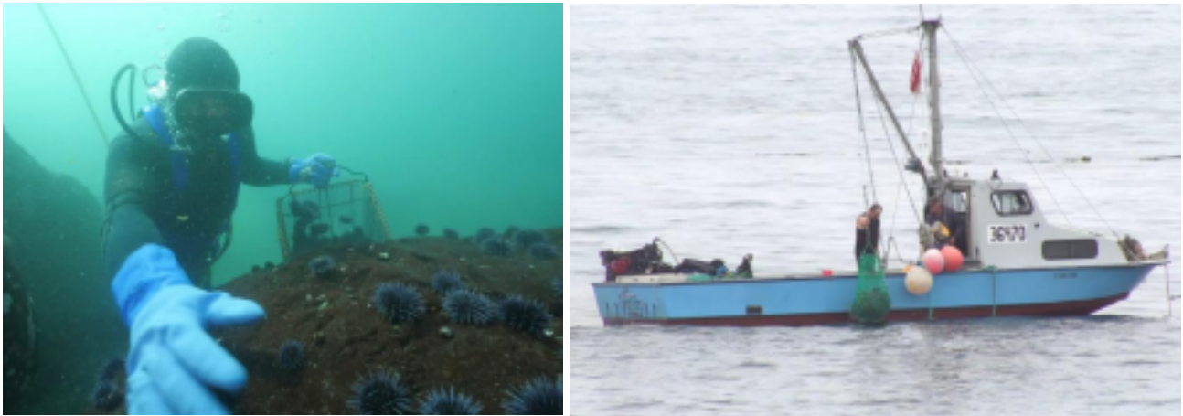
Commercial urchin dive boat (left) and a commercial urchin diver, harvesting urchins (right).

offering a fast-paced, high-quantity removal effort; their long-time experience diving in these coves brings safety and important observations about the substrate and urchin barriers (like sand bars) as hone our approach to securing long-term sustainability of cleared areas.