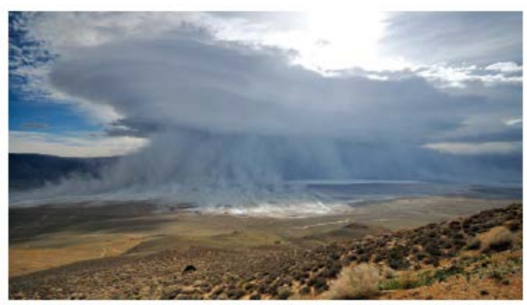
Dust storm at Owens Lake in March 2010.

The economic impacts of further declines in Great Salt Lake water levels are wide reaching and severe. A November 2019 report commissioned by the Great Salt Lake Advisory Council found that continued drying of the lake could result in economic losses between $1.69 billion to $2.17 billion per year as well as the loss of over 6,500 jobs. The report cited these losses as including "dust mitigation costs, health care costs from decreased air quality, disruption to Salt Lake City airport traffic due to increased dust storms, losses to the brine shrimp industry from increased salinity, reduced lake-effect snowpack, increased costs of treating invasive species such as phragmites, costs to mineral extraction at the Great Salt Lake due to water scarcity and declining Lake levels, and loss of Lake recreational spending." <sup>8</sup>