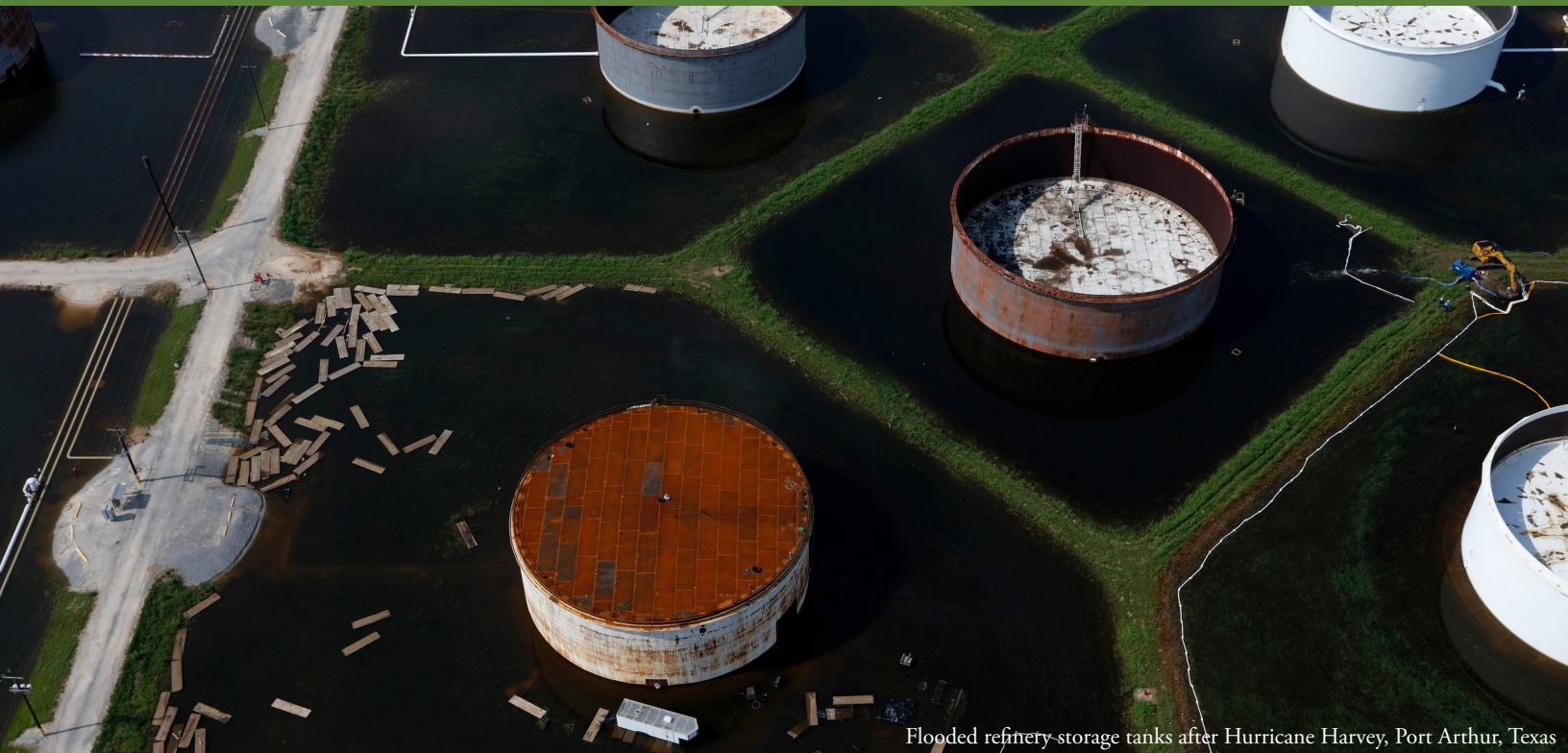
Flooded refinery storage tanks after Hurricane Harvey, Port Arthur, Texas