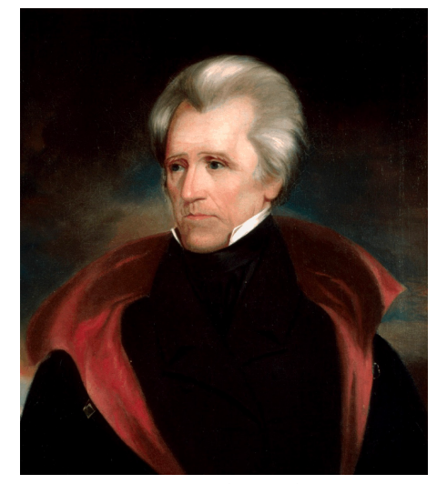
Figure 3 Andrew Jackson

applied, originating be before the constitution, and forming the basis on which it was made, bound the United States to a particular course of policy in relation to them [territorial lands] by ties as strong as can be invented to secure the faith of nations." President Jackson, Veto of the Land Bill, December 5, 1835.