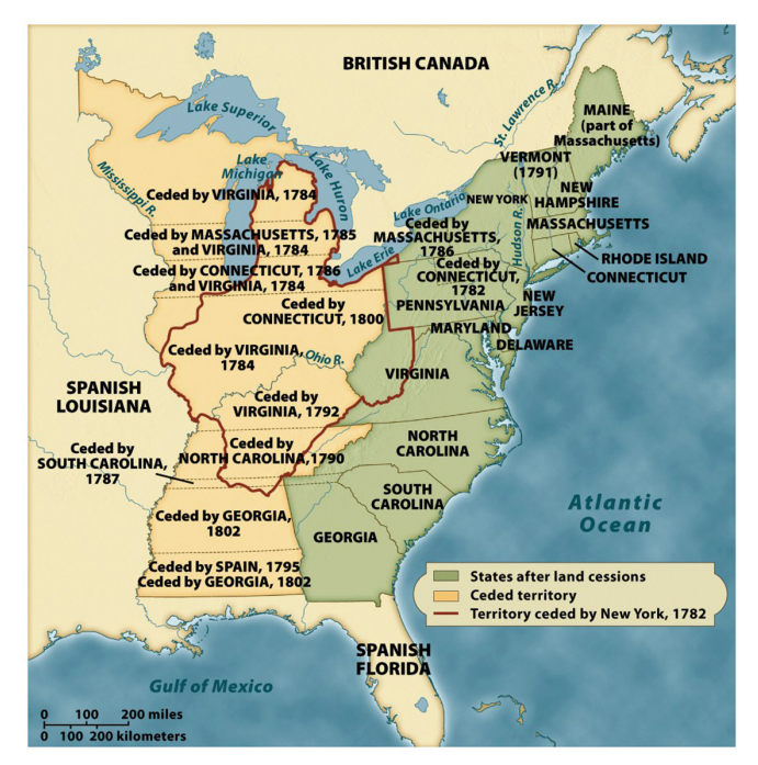
Figure 1 Former British Crown lands and state cessions in darker yellow (map from Foner)

at a time when the Continental Congress was struggling to hold the young American union together for the sake of successfully prosecuting the Revolution. We will revisit this contentious struggle between the states momentarily.