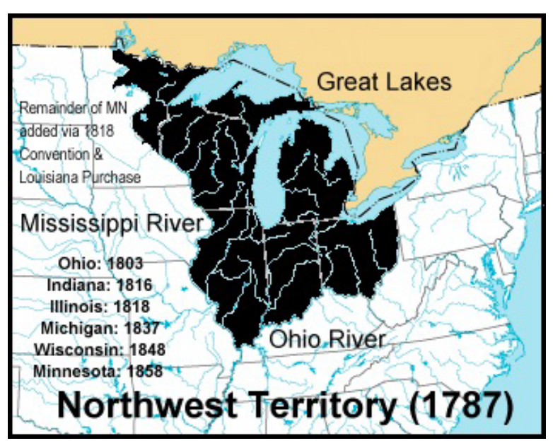
Figure 4: Northwest Territory ceded by Virginia

THE NORTHWEST ORDINANCE OF JULY 13, 1787 (The Northwest Ordinance is included in its entirety at the end of this paper.)