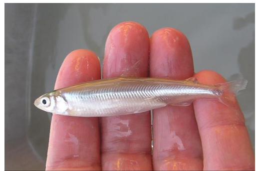
Delta smelt.

Although many factors impact the declining Delta smelt population, the Bureau of Reclamation (BOR) and the U.S. Fish and Wildlife Service (FWS) monitor whether the smelt are entrained in and around the Delta pumps. When the pumps operate, they can create a reverse flow in the Old and Middle Rivers in the Delta, which, along with other factors, can draw the smelt and other fish species, at various life stages, towards the pumps. As a result, the fish are currently monitored through what is called salvage operations to see whether fish are being entrained into the pumps. 25 In addition, the FWS trawls parts of the Delta to monitor the locations of the fish relative to the pumps. 26 Under current FWS policy the adult delta smelt anticipated take level for the 2016 water year is 56. 27 So far this year, three actual smelt have been salvaged at the pumps. 28 There is significant debate and concern that the federal government kills many more Delta smelt during trawling and other research activities. 29 The BOR and FWS determine the amount of pumping levels depending on these and other factors. The Administration will testify about these matters.