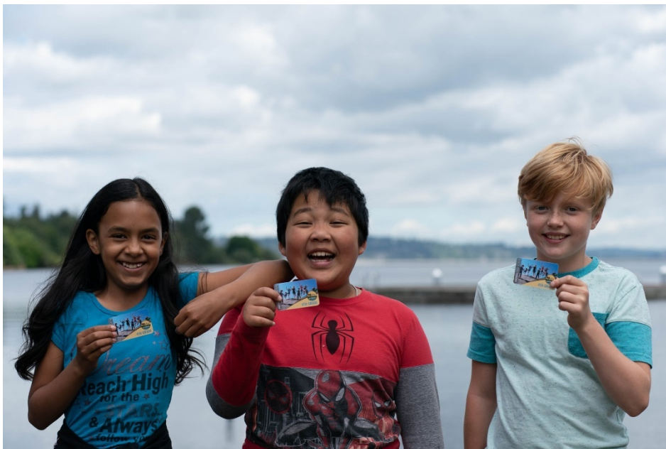
Fourth graders with their Every Kid Outdoors pass.

Finally, this title supports increased recreation visits for young people. The EXPLORE Act directs the creation of a national strategy to increase youth recreation visits to federal lands and extends the Every Kid Outdoors Program for an additional 7 years. This program grants 4 th graders free access to national parks and public lands for an entire