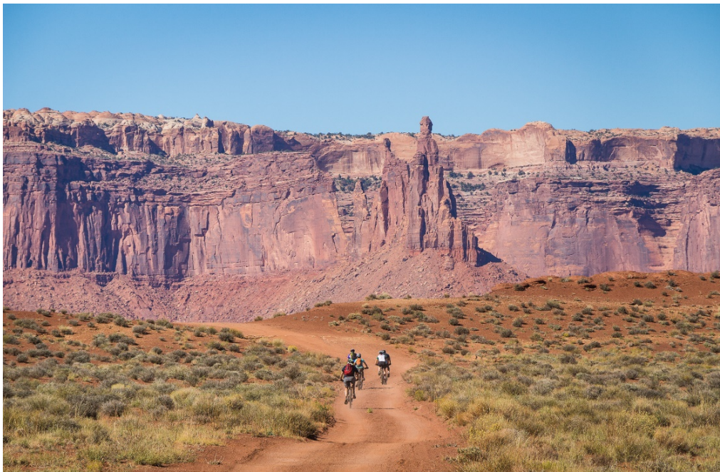
The White Rim Trail in Canyonlands National Park in Utah stretches over 100 miles long. The EXPLORE Act requires the completion of similar long-distance bike trails.

The EXPLORE Act also maintains and improves access to some of the most beloved recreation activities in America. First, the bill protects the use of fixed anchors used by rock climbers in iconic wilderness destinations. Earlier this month, NPS and USFS announced a proposed