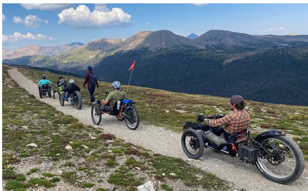
An example of an adaptive recreation in Rocky Mountain National Park, Colorado.

Along with lacking a cohesive strategy for recreation, many national parks and public lands are not accessible to wounded warriors and to those with disabilities broadly. 22 The presence of these accessibility barriers is no trivial matter; approximately 1 in 4 Americans has a disability, with roughly half of that population having a disability that affects their mobility, and individuals with disabilities disproportionately suffer from mental health issues. 23 While guidelines under the Architectural Barriers Act of 1969 (ABA) require outdoor recreation spaces such as campgrounds and trails to display accessibility information, this usually only applies to newly constructed trails. 24 Existing trails often lack sufficient information about accessibility features such as width, surface, slope, and obstacles. In many cases, trails have never been graded for accessibility. 25 Even if a trail or recreation opportunity is accessible, it can take “an insurmountable amount of work to find information on a park’s website” about which parts of the park are or are not accessible. 26