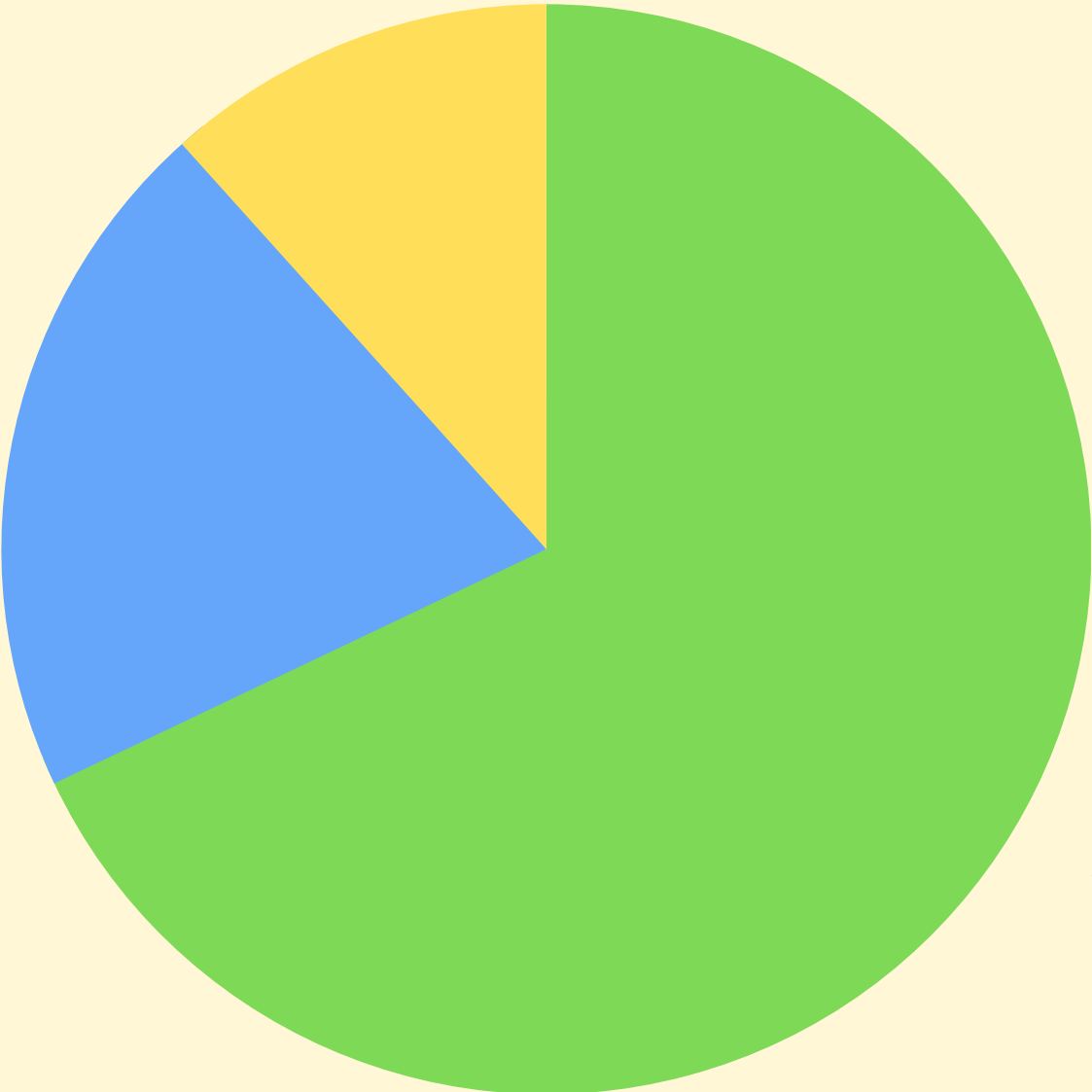
Acreage of Greenspace on the National Mall