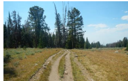
Trail damage in the Bridger Wilderness from improper use and poor maintenance.

abolish Wilderness or dilute it out of all recognition. The latter are almost certain to tell the gullible that H.R. 1349 is part of that ultimate goal. Other privileged users of public space assert that whatever they do in Wilderness (high-impact camping, off-trail use, nocturnal disturbance of animals, trail damage, trampling of meadows, etc.) is compatible with Wilderness values but mountain biking isn't. For-profit commercial pack train operations in particular damage iconic Wilderness areas, yet their owners can be expected to oppose H.R. 1349 on specious grounds that bicycling is environmentally harmful or necessarily intrusive. But Congress meant for rugged, self-reliant travel to define the Wilderness experience, and human-powered mountain biking fits right in.