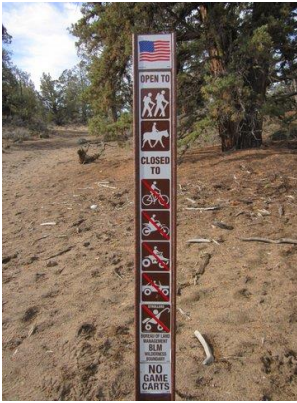
A boundary sign at the Oregon Badlands Wilderness east of Bend, Ore.: No baby strollers, bicycles, or game carts.

As for “mechanical transport,” events on the ground have gone astray from Congress’s intent. One of our supporters met a Forest Service ranger who said she “had to kick some young parents with a [baby] stroller off of a trail in the wilderness earlier in the week because it was a ‘wheeled, mechanized device.’ ” Our supporter commented, “I was sorry to hear this forest service ranger proclaim (almost proudly) that she had stopped somebody with a stroller.”