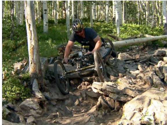
An adaptive cyclist navigates a rugged trail near Crested Butte, Colo., an activity disallowed in Wilderness areas.

“Section 4(c) of the Wilderness Act (16 U.S.C. 1133(c)) is amended by adding at the end the following: ‘Nothing in this section shall prohibit the use of motorized wheelchairs, non-motorized wheelchairs, non-motorized bicycles, strollers, wheelbarrows, survey wheels, measuring wheels, or game carts within any wilderness area.’”