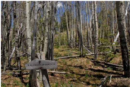
A dilapidated, almost invisible trail in the Aldo Leopold Wilderness, near Silver City, N.M. (Photo dated May 2011.)

Despite these admonitions, the Forest Service maintained and added unwarranted restrictions, including restrictions on its own ability to maintain Wilderness trails. (Quixotically, the Forest Service forbids its own workers to routinely use wheelbarrows and chainsaws for trail maintenance.)