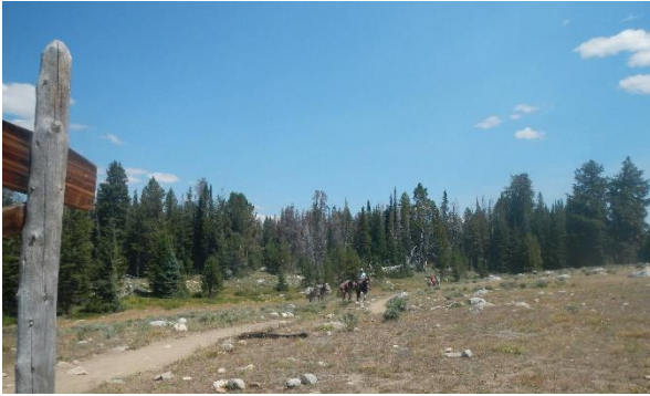
A commercial pack outfitter improperly leads his pack string off the trail in the Bridger Wilderness near Pinedale, Wyo.

whether or not IMBA members, are actively opposing bicycling in Wilderness. Unanimity is impossible to obtain in any large population, and among the likely hundreds of thousands of mountain bikers nationwide, outliers can be expected.