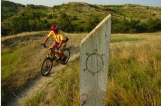
Mountain biking on the Maah Daah Hey Trail in Little Missouri National Grassland, North Dakota. This well-preserved section is maintained by volunteer mountain bikers.

Maah Daah Hey Trail is the longest Forest Service trail that allows bicycling. It runs from near Watford City to Medora. Its 144-mile tour of western North Dakota's badlands draws visitors from around the U.S and Canada and benefits the local economy.