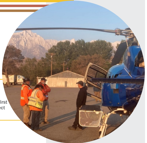
Lone Pine Paiute Shoshone and Timbisha Shoshone cultural monitors getting pre-flight safety briefing and COVID-19 check on first day of operations at Mojave Project during Phase I exploration