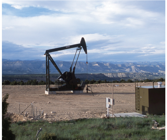
Oil and Gas Rig.

During the lease sale private companies bid against one another for the right to lease each parcel. The company with the highest bid wins the lease. This is a one-time payment and provides the private company with the exclusive rights to develop oil and gas on the parcel of federal land for a period of ten years.