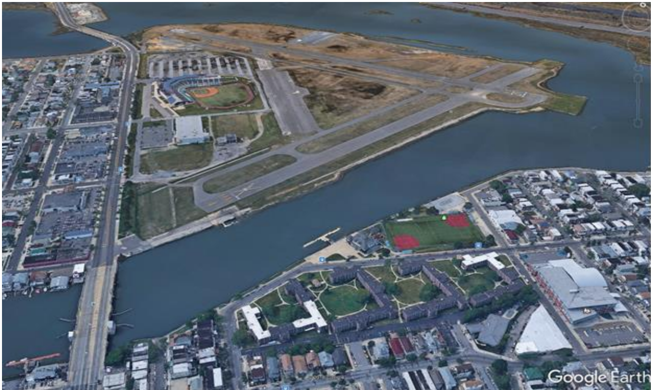
Figure 7: Bader Field Aerial Image

The proposed site will likely require a mix of floodproofing techniques in order to ensure the site's flood resilience. The difference in elevations will entail leveling and grading the site to ensure that the building is at the highest feasible elevation. The site could be the recipient of beneficially re-used dredged material from dredging projects currently planned for the Intracoastal Waterway. An elevated building with public space and parking below similar to the Coastal Studies Institute in North Carolina is a design option. Another option is to elevate the site using dredge materials mixed with stabilizing agents to preform similar to structural fill.