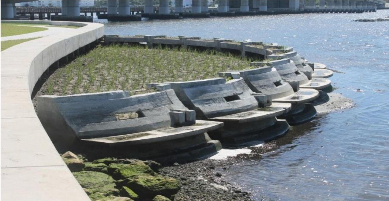
Figure 8: Living Shoreline Seawall

Ensuring public access and ecological uplift with this project is crucial. The proposed project should incorporate a living shoreline that serves to revegetate the waterfront and provide habitat. Water access will be incorporating by renovating the City's boat ramp and installing a removable flood gate to ensure that boat ramp does not become a resiliency weakness during storm events. The image in Figure 9 shows a living shoreline seawall in Palm Beach County, Florida that is designed to retain soils to grow mangroves and emergent grasses while providing fish passage and public art. This type of living shoreline would be ideal for providing an armored water's edge while also supporting the development of new habitats in areas where none exist currently.