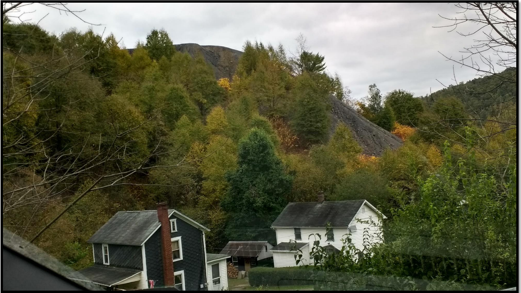
Coal refuse towers above houses in Ehrenfeld, PA and nearby communities. As part of an AML and AML Pilot I contract, 3.2M tons of refuse material will be removed resulting in 62 acres of reclaimed land.