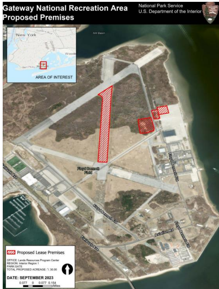
Source: Lease Between U.S. Dep’t of the Interior, National Park Service and the City of New York for the Premises known as Portions of Floyd Bennett Field, in the Jamaica Bay Unit of Gateway National Recreation Area.

degrade the resources at the park unit, as well as reduce the availability for cultural and recreational opportunities for visitors, and likely increase NPS maintenance needs in future years.