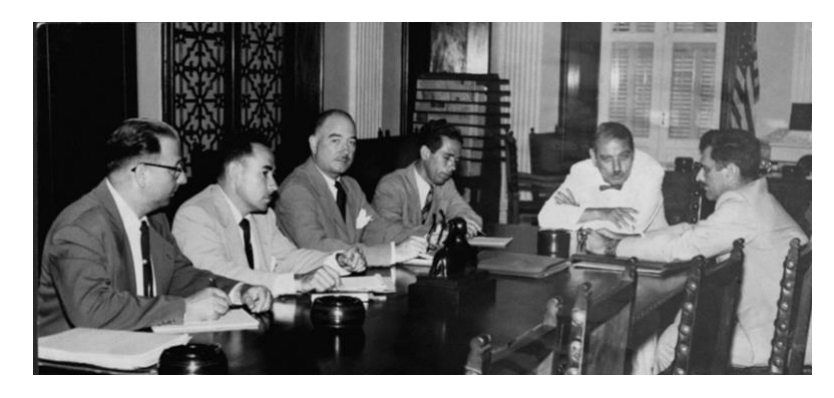
Figure 1 PREPA's Board in 1953 during a meeting with the then Governor of Puerto Rico Luis Muñoz Marín.<sup>22</sup>

The end result is that as Figure 1 shows, there has been almost no change in the composition of PREPA's Board since 1953, at least in terms of gender, race, socio-economic status and societal sector.