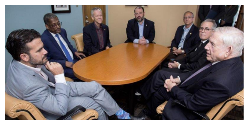
Figure 2 PREPA's Board in 2018 during a meeting with current Governor Ricardo Rosselló<sup>23</sup>.

There was an attempt, during the reconstruction process after hurricane Maria, to transfer power from internal political forces to external "neutral" parties" through the intervention of the Southern States Energy Board<sup>24</sup>. In the SSEB proposal to the Department of Energy there were several scheduled stakeholder engagement activities. However, in the 21<sup>st</sup> century, stakeholder involvement and public participation in energy policy cannot be treated as a collection of activities. They need to be continuous processes based on long term relationships and trust. In this sense, the insertion of the SSEB and other very reputable organizations such as the Rocky Mountain Institute have been insufficient to curb the current regime's need for enhanced centralization and control. An example of this is the unfulfilled Senate's commitment to use RMI's report as the basis for the new regulatory framework for PREPA's privatization. The report, that included more or less multisectorial agreements was significantly altered by the political bodies before even considering it<sup>25</sup>.