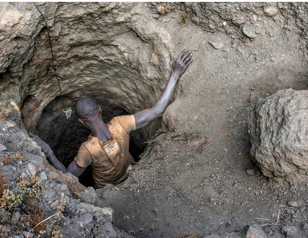
A creuseur, or digger, descends into a Congolese copper and cobalt mine in Kawama. Wages are low, and working conditions are dangerous, often with no safety equipment or structural support for the tunnels.

Transparency of supply chains is a means to an end and will only be effective if consumers or regulators start to differentiate between products being provided. There are effective lessons on traceability and transparency arising from the Kimberley Process for conflict diamonds; the Extractive Industries Transparency Initiative for oil, gas, and mineral resources; and the Fairmined Standard for gold that could be applied to the mineral supply chains needed for decarbonization. Paramount among these is an acknowledgment that traceability schemes offer a largely technical solution to profoundly political problems and that these political issues cannot be circumvented or ignored if meaningful solutions for workers are to be found. Traceability schemes ultimately will have value if the market and consumers trust their authenticity and there are few potential opportunities for leakage in the system.